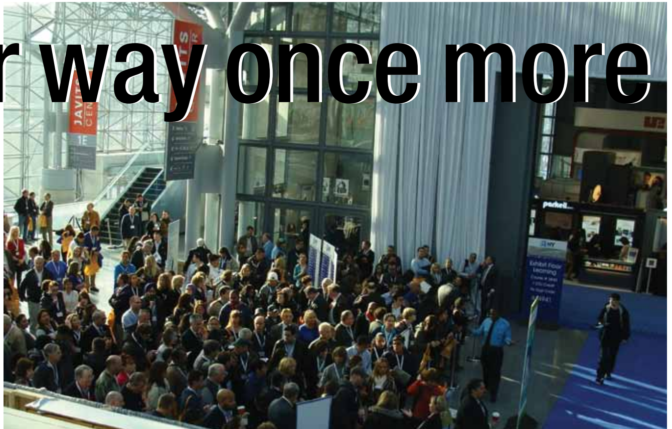
• It's almost as exciting as Black Friday! Attendees at the 89th annual Greater New York Dental Meeting assemble a few moments before the official exhibit hall opening.

On Sunday, opening day of the meeting, the exhibit hall floor was jam packed with meeting attendees looking for new, exciting offerings. On display here at the Jacob K. Javits Center are products and services from hundreds of exhibiting companies.