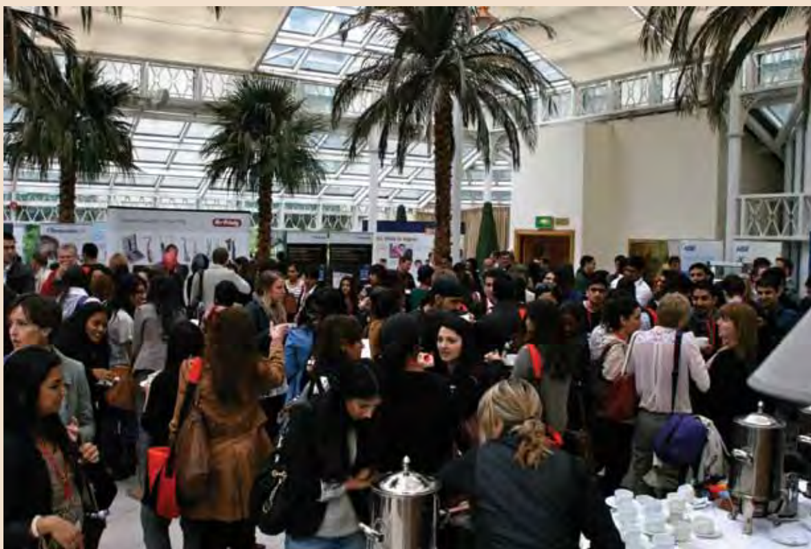
Delegates and exhibitors mingle