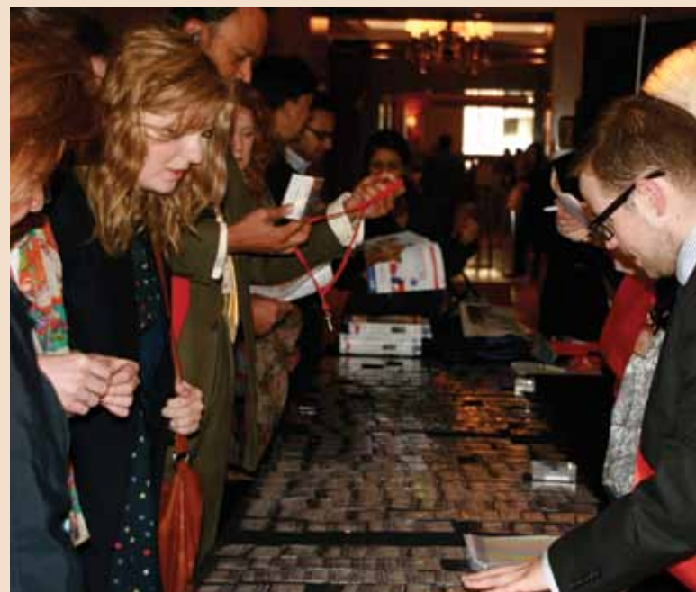
Visitors receive their passes and day programmes