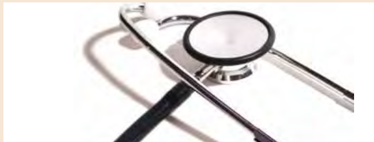
It has been agreed that GP’s should be spared the fee to register with CQC

which GP practices to inspect and reiterated its belief that registration was a bridge too far. DT