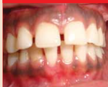
Hyperpigmentation Using the diode laser