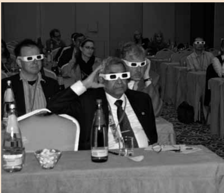
Innovation in practice