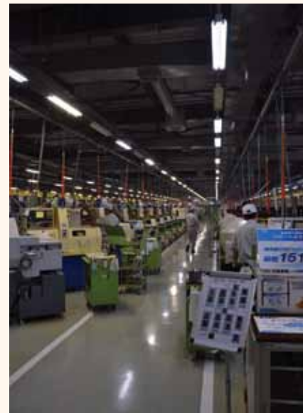
NSK still manufactures most of the precision parts in-house.