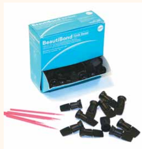
Shofu's BeutiBond.