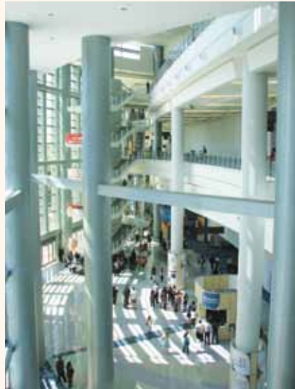
Inside the Anaheim Convention Center.