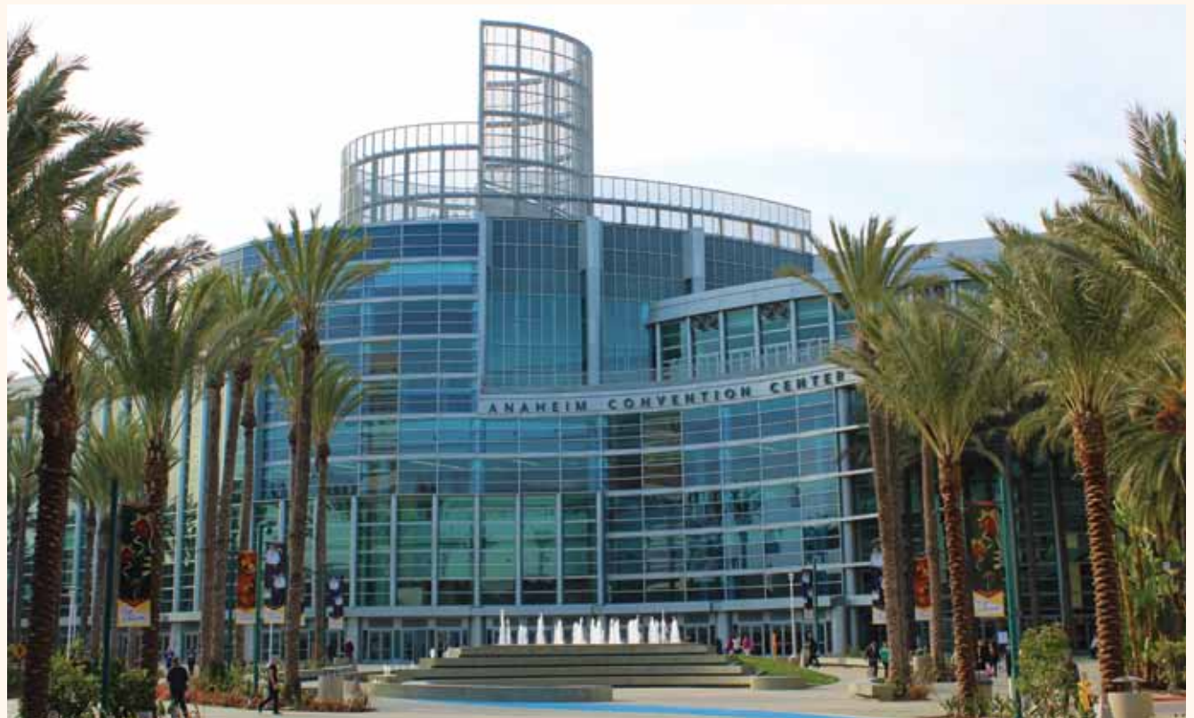
The Ocean Fountain in front of the Anaheim Convention Center.