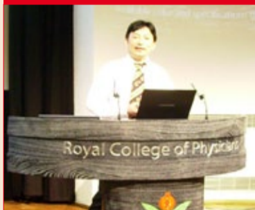
Conference success Smile-on plays perfect host at CIC 2011