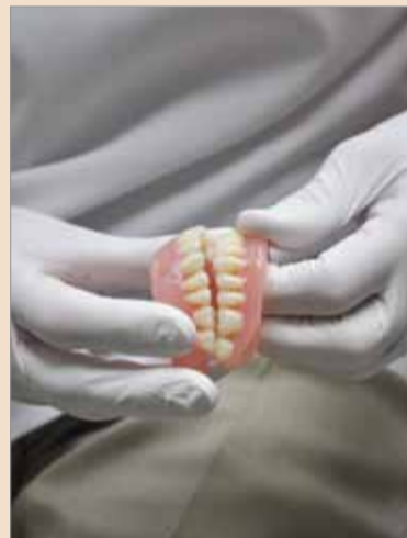
Killer bugs could live on dentures

The study has been published in the Journal of the American Dental Association . DT