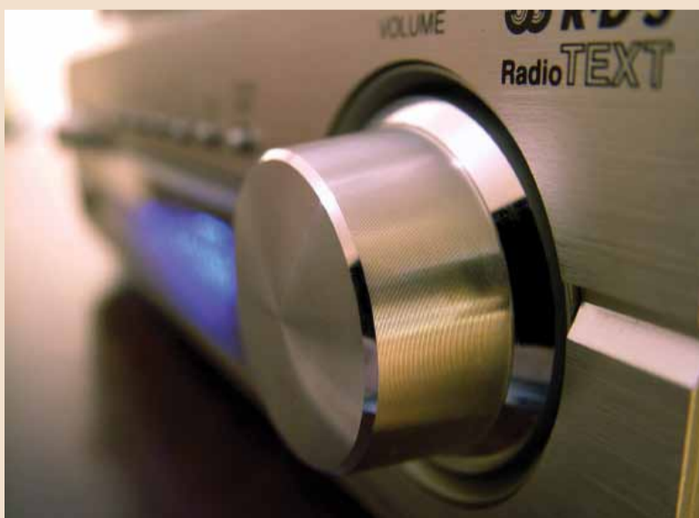
Dentists performing copyright music in their surgery do need a PRS for Music* licence

I f you're a dentist performing copyright music in your surgery, it has been announced that you do need a PRS for Music* licence.