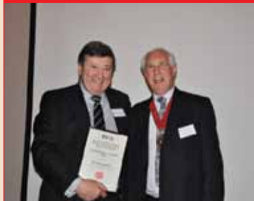
Alumnus of the year King's College announce awards