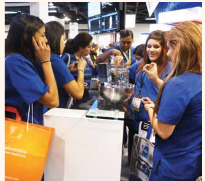
Dental students from Charter College in Long Beach admire the free dental buttons at the Henry Schein booth, No. 2424.