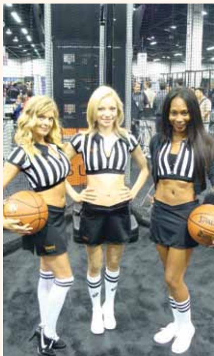
Take a basketball shot at the Suni booth (No. 2552) to win an iPad.