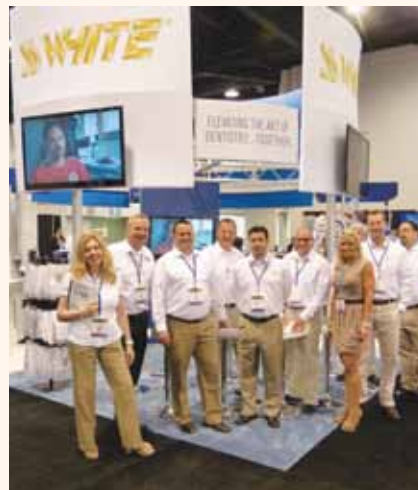
The SS White sales and marketing team shows off its new booth (No. 1180), which is making its general dentistry conference debut at CDA Presents.

A general dentist or endodontist can request that an SS White representative visit the practice to provide a thorough clinical presentation on the science behind