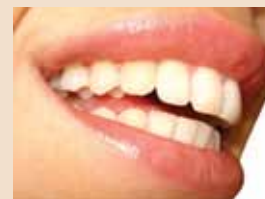
Dentist calls for stop on 'salon' whitening treatments

• Ann Keen Secretary of State for Health in July 2007 confirmed that government supports the GDC position that Tooth Whitening is the Practice of Dentistry: 25 July 2007 : Column 1208W [R] [152011] http://www.publications.parliament.uk/p...3w0006.htm