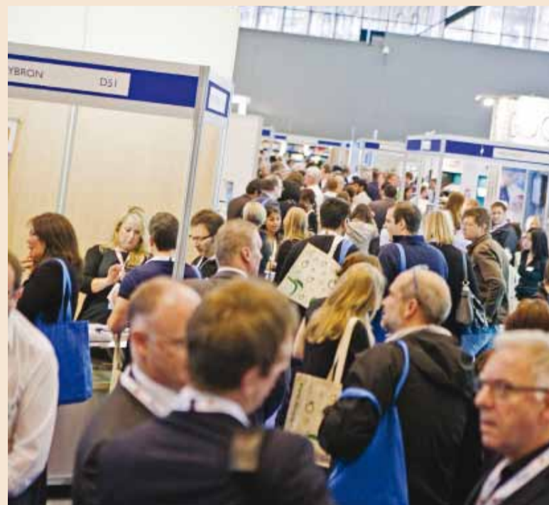
Delegates at the British Dental Conference and Exhibition

On Thursday the entertainment begins at 18:00 at the Central Hall with the exhibition hall drinks reception as the BDA hosts a get together to celebrate the opening day of the event!