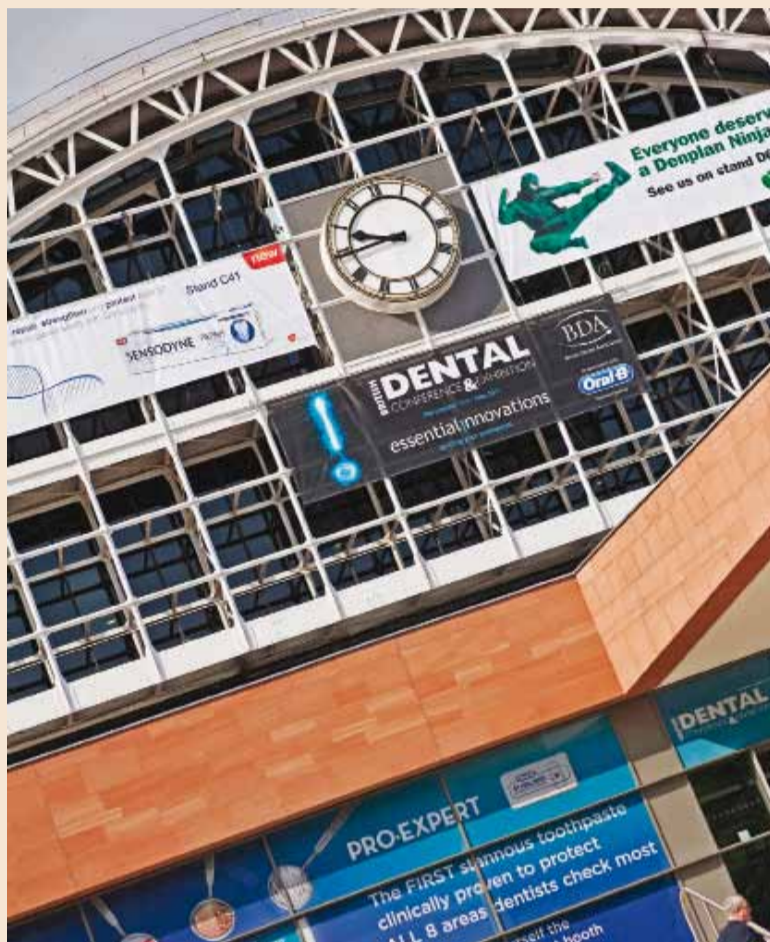
Outside the Manchester Central Convention Complex

Dental Tribune previews this year's Manchester event