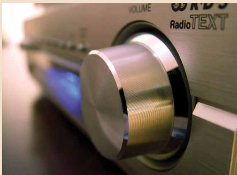
Dentists performing copyright music in their surgery do need a PRS for Music* licence

If you're a dentist performing copyright music in your surgery, it has been announced that you do need a PRS for Music* licence.