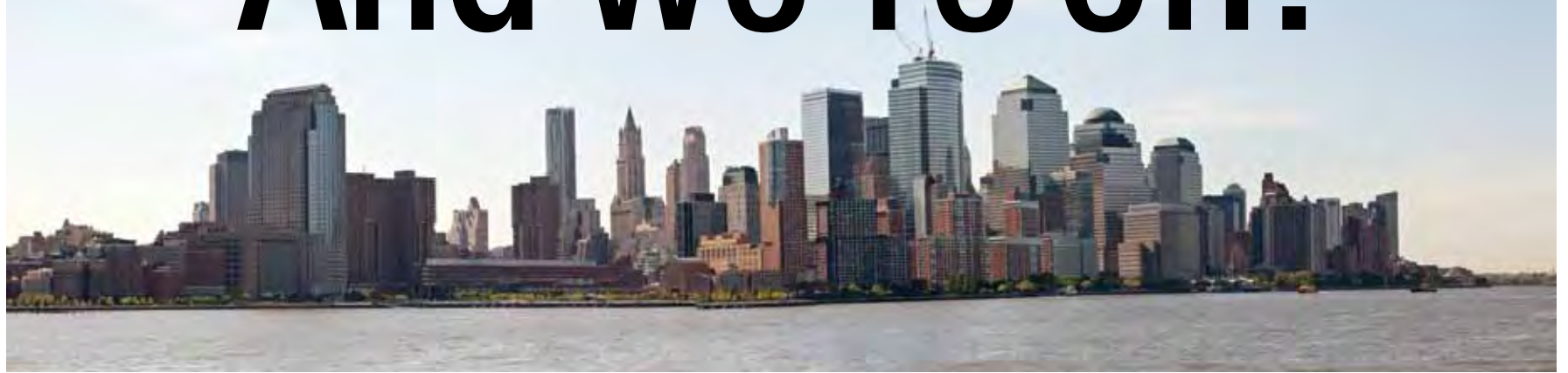
• New York City offers plenty to see and do.