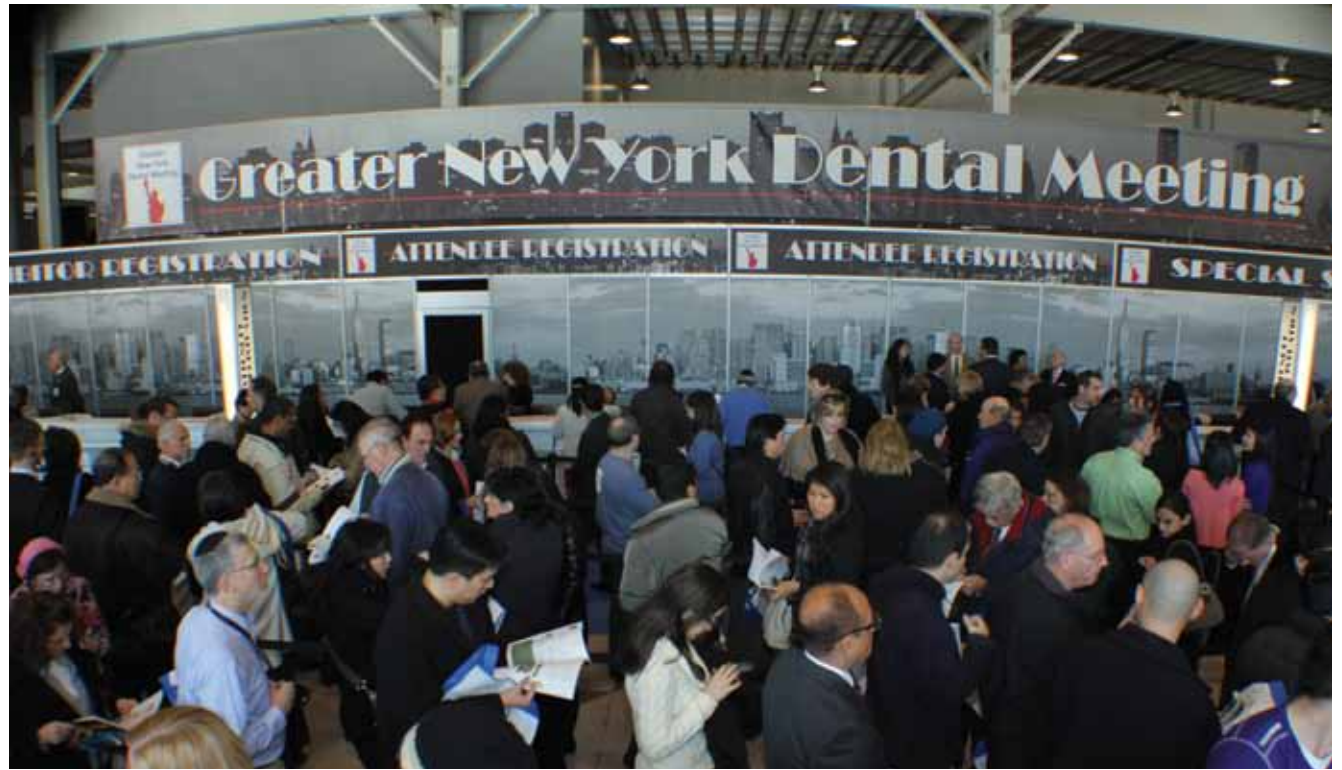
Attendees register for the Greater New York Dental Meeting.

Once again, the GNYDM offers an unparalleled educational program,