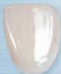
BioTemps ® provisional crown included