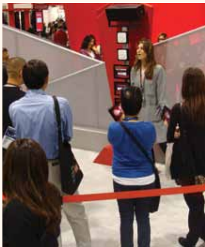
Meeting attendees learn about products for oral hygiene at Colgate (booth No. 1316).