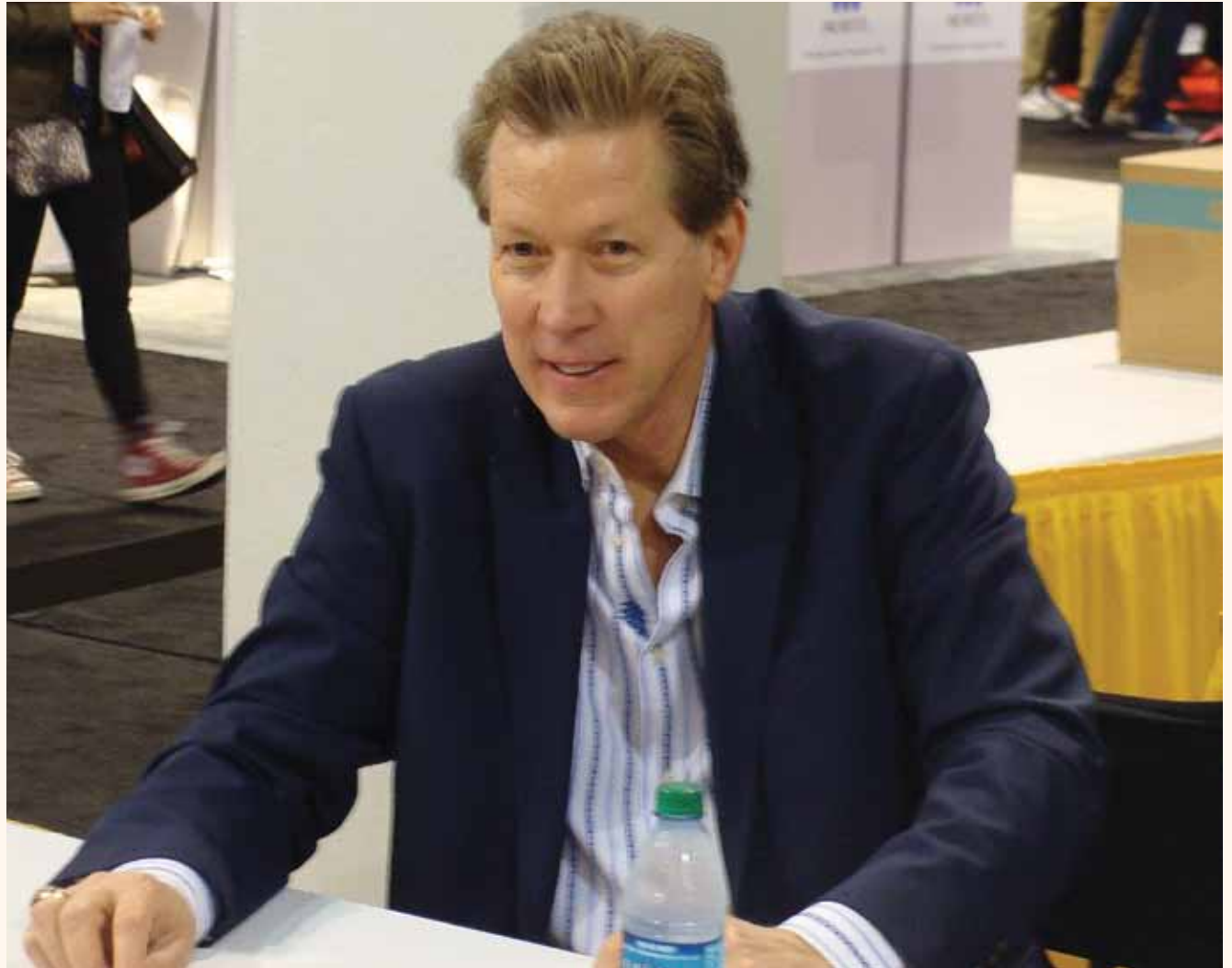
Retired MLB pitching ace Orel Hershiser at the Glove Club (booth No. 832).