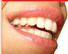
'Shop a salon' Dentist stands up against illegal dentistry