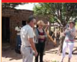
The Musoma story The AOG reports from Tanzania