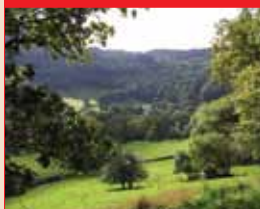
Sale in the sticks A retired orthodontist discusses practice sales