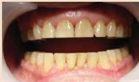
Dentists have seen an increase in the number of patients suffering from bruxism

"So there certainly seems to be a significant increase