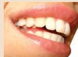
Dentist calls for stop on 'salon' whitening treatments