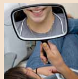
Being happy with your teeth can impact a person's confidence

said that the expense is the main reason for not visiting the dentist regularly. Although three in ten people have landed themselves in debt or had to make sacrifices in order to cover unexpected dental bills, only one in ten people has dental insurance. m