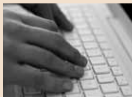
Online access will 'make life easier'

Using information and technology to put people in greater control of their health and care is at the heart of the Government's strategy: The power of information.