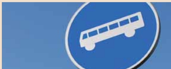
Tooth bus offers free NHS dental treatments

For more information visit www.toothbus.co.uk http://www.toothbus.co.uk/news/tooth-bus-launches.html