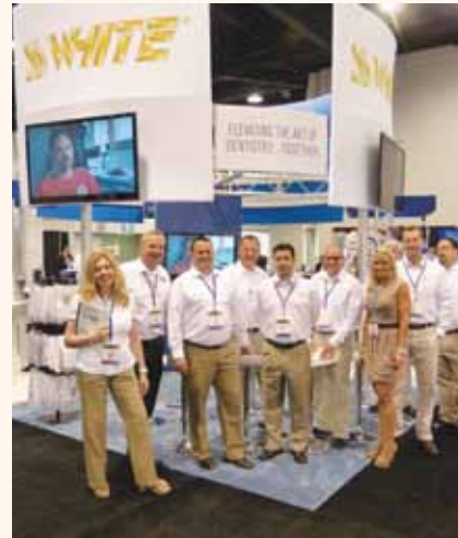
The SS White sales and marketing team shows off its new booth (No. 1180), which is making its general dentistry conference debut at CDA Presents.

A general dentist or endodontist can request that an SS White representative visit the practice to provide a thorough clinical presentation on the science behind