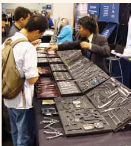
Meeting attendees shop for hand instruments at DoWell's booth (No. 224).