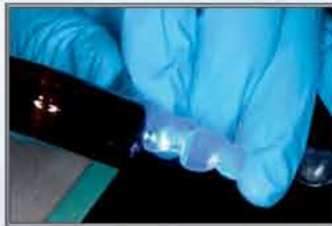
Cure the Bond Aligner™