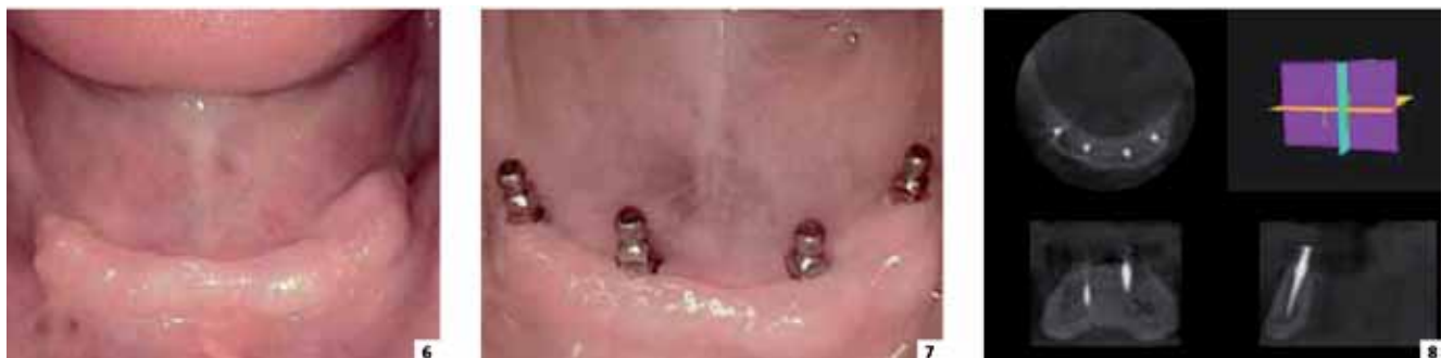
• Figs. 6-8: The minimally invasive implantation method is especially suitable for patients at risk. It is possible to perform the MIMI surgery and to set the metal matrices of the tulip-headed Champions Implants in an available prosthesis within just one day.

'Additionally, some dental surgeons will find it easier to work with the two-piece implants, which often make temporary restorations unnecessary.'