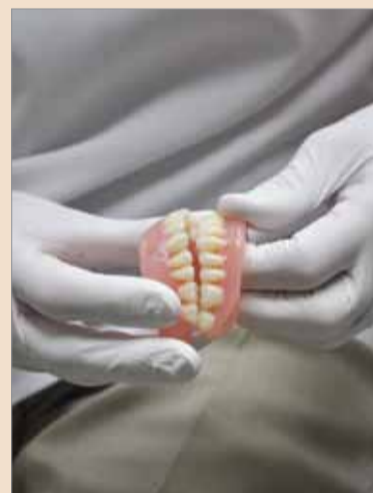
Killer bugs could live on dentures

The study has been published in the Journal of the American Dental Association . DT