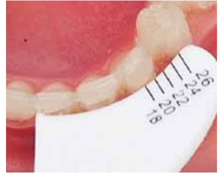
Extend measuring device.