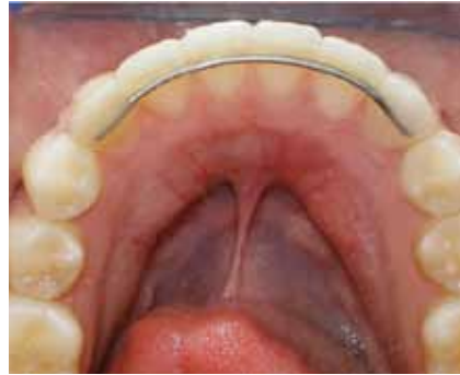
Extend in mouth.

For the remaining anteriors, Extend must be adapted to the lingual sides of each tooth. A bird beak plier should be used for slight adaptation bends, while more extensive bends can be achieved