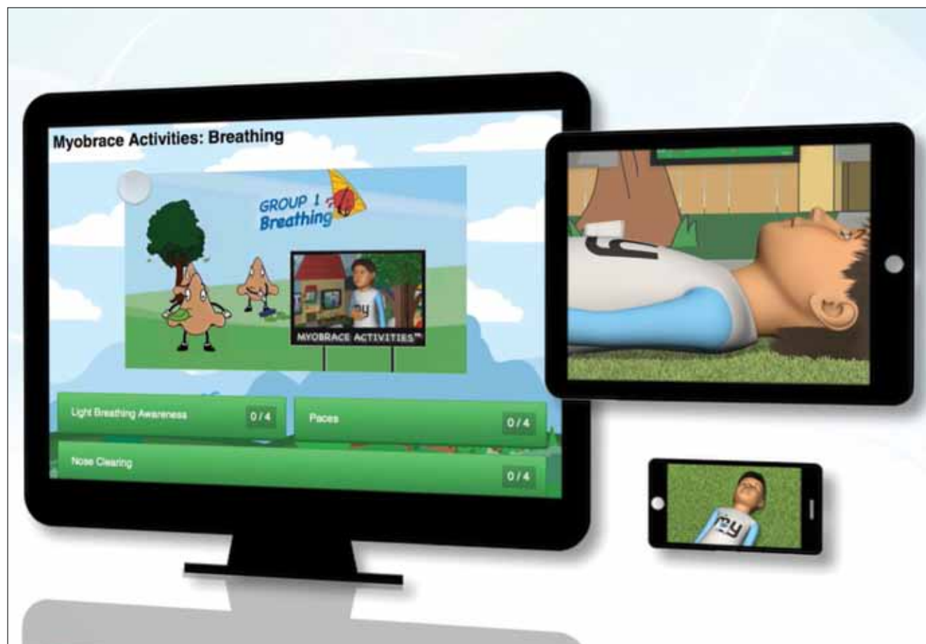
The Myobrace Activities app is a great way to help children learn lifelong health habits.