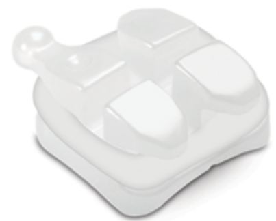
APC™ Flash-Free Adhesive Coated Appliance System

Come by the 3M Unitek booth to hear about our NESO Special