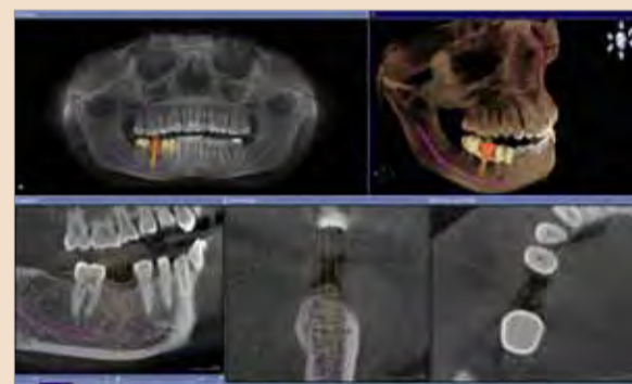
Fig 4 Integrated planning