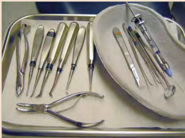
The unit was using improperly sterilised instruments

The Centre for Health Protection has been informed by the University of Hong Kong Health Service's Dental Unit that it treated hundreds of patients with improperly sterilised instruments last week. More than 254 people, including staff and students, are reported to have received dental treatment under these conditions between 30 October and 2 November.