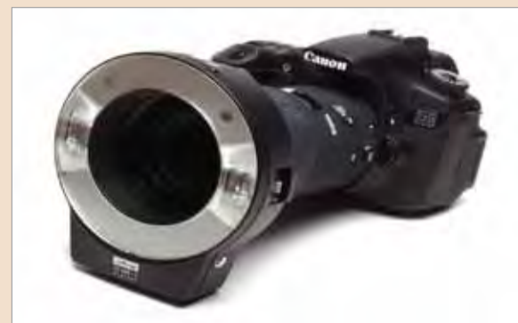
Fig 2 Dental camera system