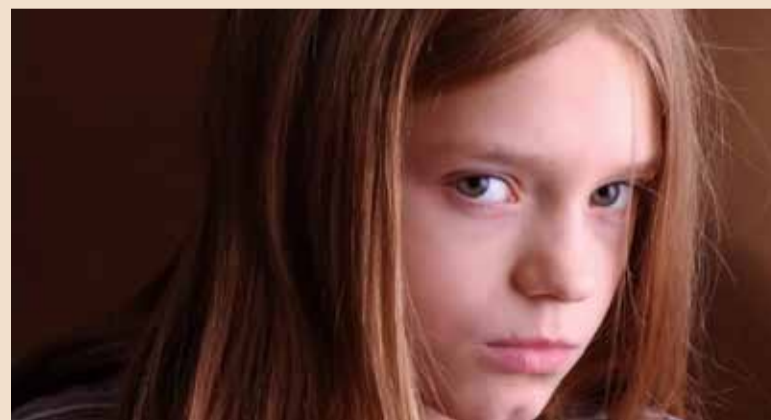
13 per cent of 10-14-year-olds report bullying

Research from the Journal of Orthodontics shows that being bullied is significantly associated with orthodontic treatment need, with 13 per cent of adolescents aged 10-14 examined for orthodontic treatment reporting being bullied.