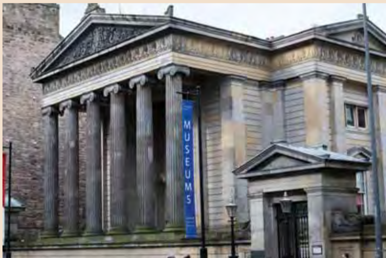
The Royal College of Surgeons Edinburgh

In a move to recognise and support the professional development of Specialty Dental Members of world-