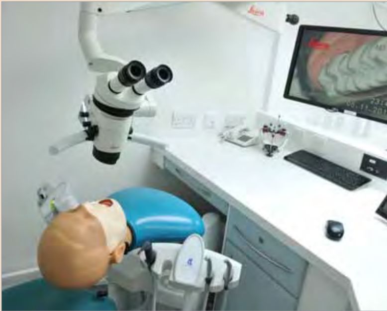
The Northwick Park DEC will be available for lectures and hands-on training

A new state-of-the-art dental training centre has been opened at Northwick Park Hospital.