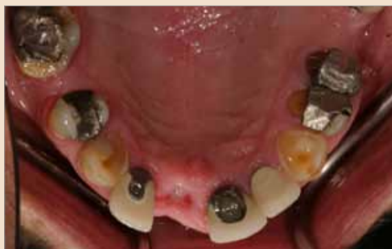
Fig 1 Occlusal View

Finally, photographs are imperative in visualising the possibilities during treatment planning. Not only do they allow the dentist to plan treatment without the patient being present but also to help work out how best to fit the teeth within the framework of the patients face for function and aesthetics. For example, rest position, E position and tipped down smile views will, together with other views, aid in planning the vertical and the horizontal position of the upper incisors,