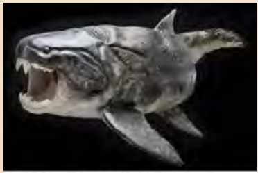
A member of the extinct fish group Placodermi.

It takes both teeth and jaws to make a pretty smile, but the evolutionary origins of these parts of our anatomy