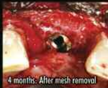
4 months: After mesh removal