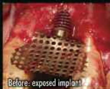
Before: exposed implant