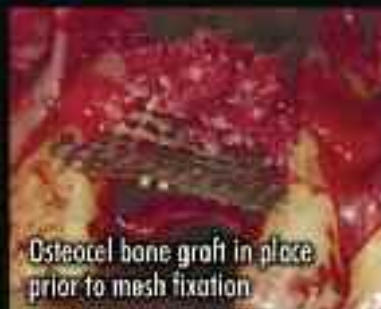
Osteocele bone graft in place prior to mesh fixation