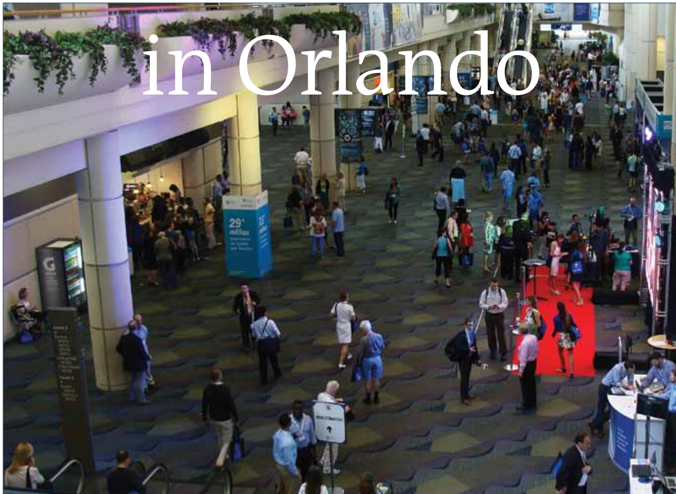
The Orange County Convention Center is teeming with orthodontic professionals during the AAO's 2016 Annual Session.

AAO attendees find lots to smile about at annual session