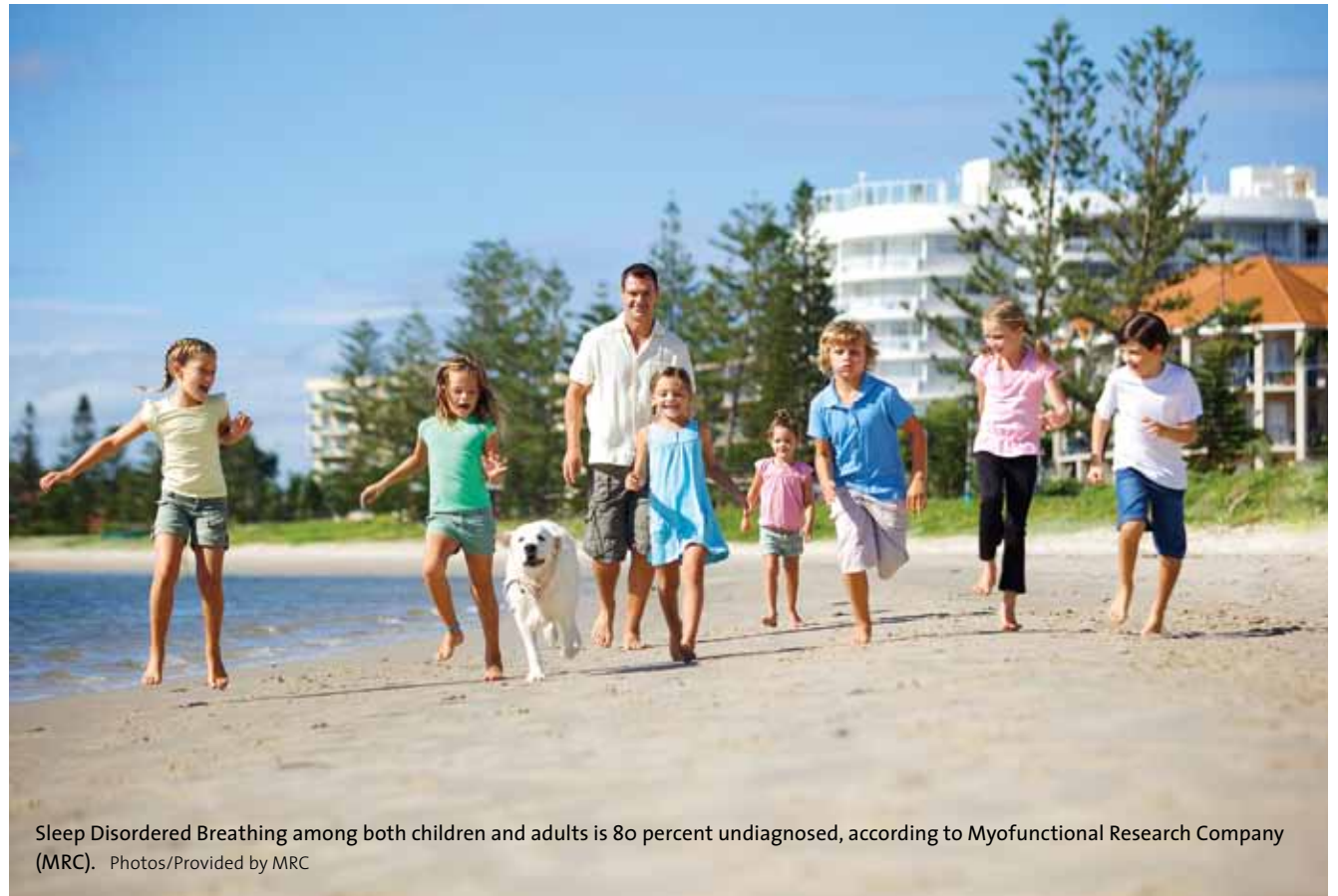
Sleep Disordered Breathing among both children and adults is 80 percent undiagnosed, according to Myofunctional Research Company (MRC).

The first step toward tapping into this new revenue source is to realize that each day more business walks out of your practice than is actually treated there. Virtually all growing children have a developing malocclusion and early treatment or, where possible, prevention is sought after by parents. Additionally, 35 percent of adults experience chronic pain as a result