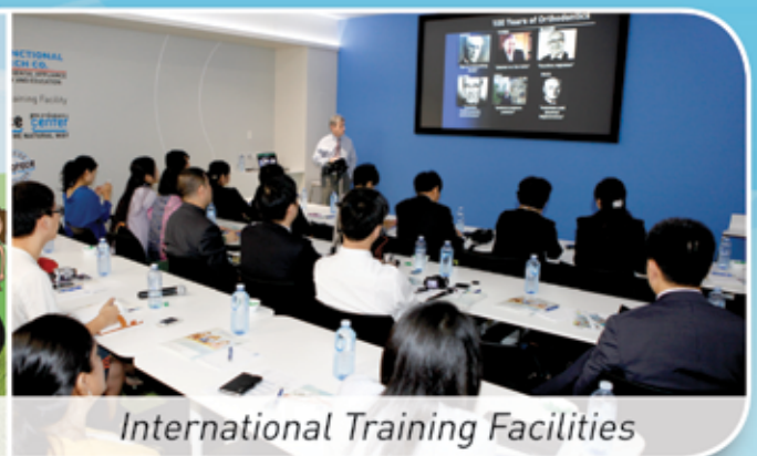
International Training Facilities

"Research presented in our journal in the next century may shed new light that will help us better identify the problem and aid the specialty (orthodontists) in developing more effective evidence based treatment. Additional efforts are needed to understand the physiology, neurology and genetics of sleep breathing disorders." American Journal of Orthodontics 2015;148:740-7