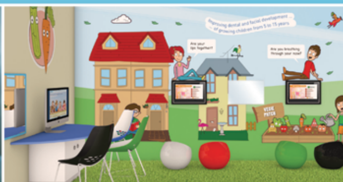
Practice Layout and Management Systems