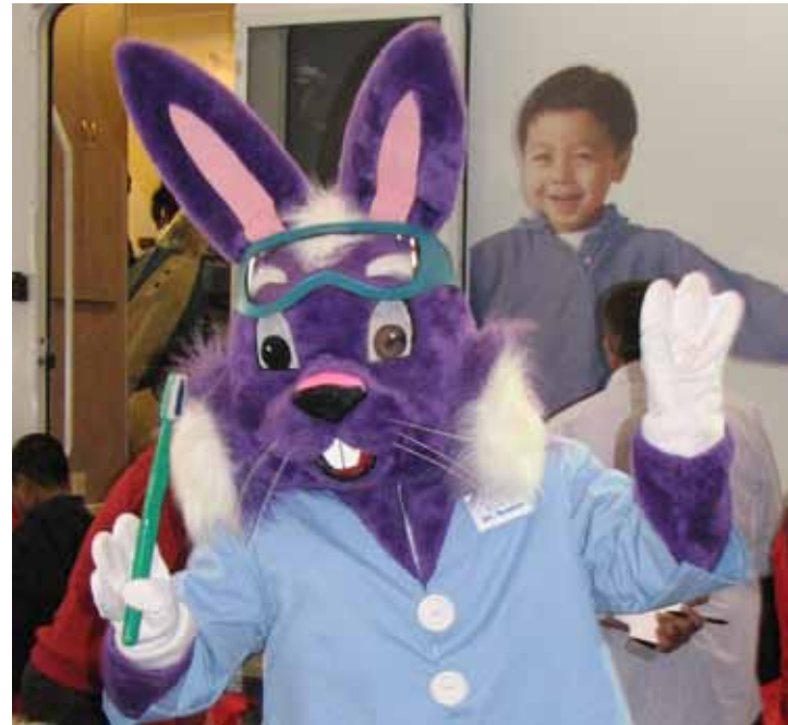
• Dr. Rabbit has a message for kids at the 2011 Greater New York Dental Meeting — Brush! He will be back again this year to educate even more children.

A child-friendly nutrition center is packed with plastic fruits and vegetables to teach the children how to build a well-balanced plate with all the healthy food groups while puppets