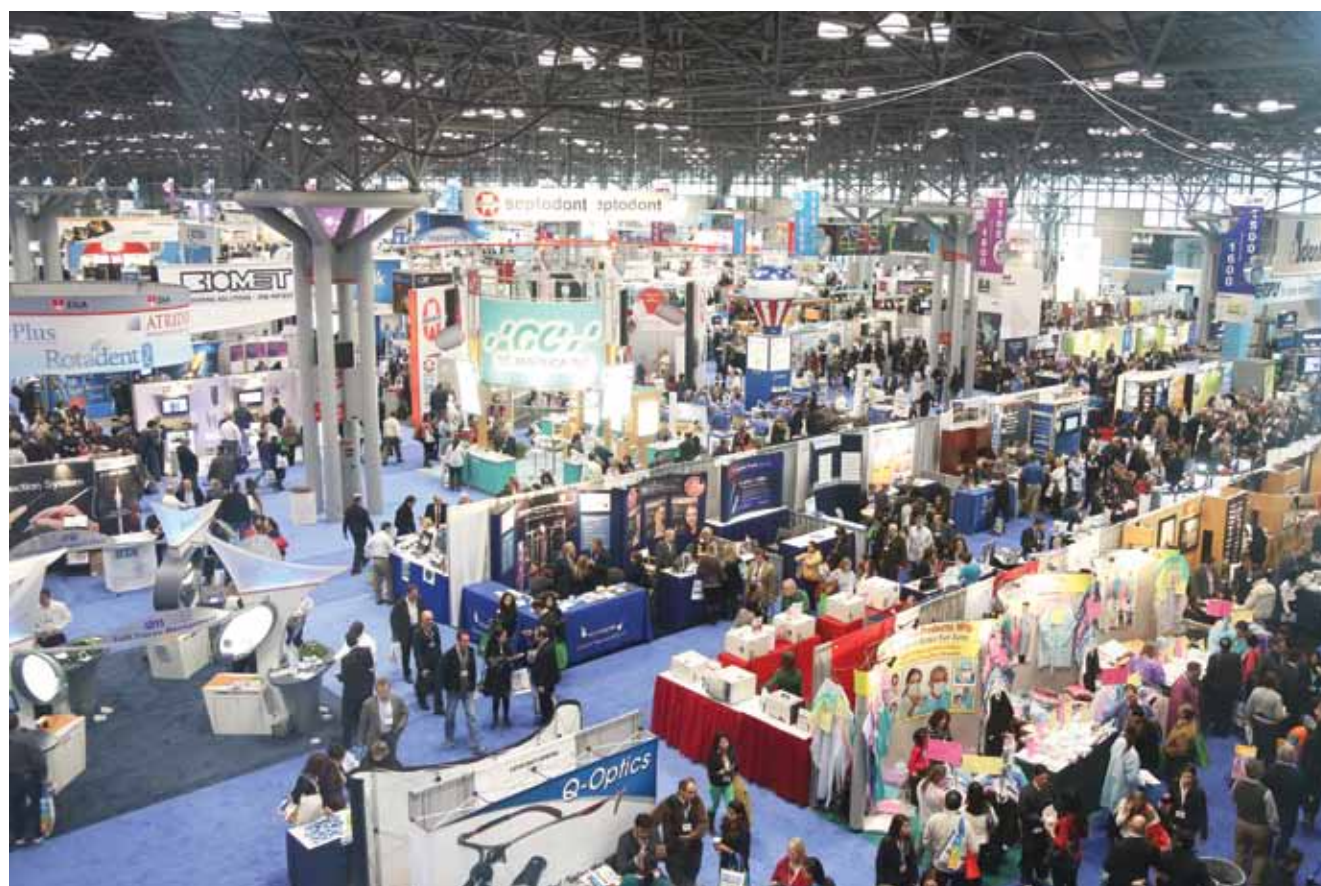
Attendees crowd the aisles of the exhibit hall on Sunday morning, opening day of the 2012 Greater New York Dental Meeting.