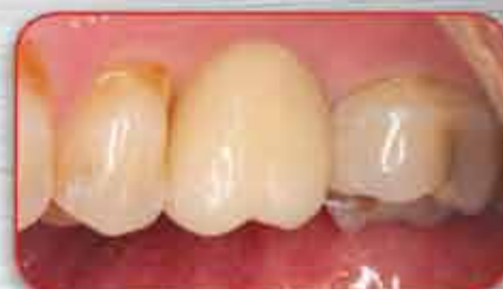
Your implant restoration is returned for seating

Clinical dentistry courtesy of Tarun Agarwal, DDS, PA