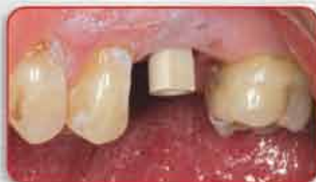
Attach the Inclusive Scanning Abutment

Scanning for custom implant abutments & crowns improves precision and lowers costs