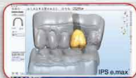
Submit digital impression to Glidewell Laboratories