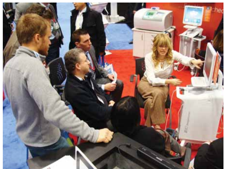
• Meeting attendees learn more about D4D technology at the Henry Schein booth (No. 3824).