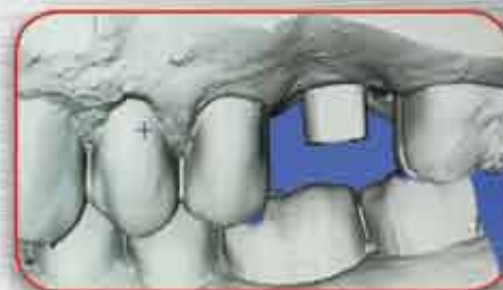
Scan the abutment and opposing with intraoral scanner