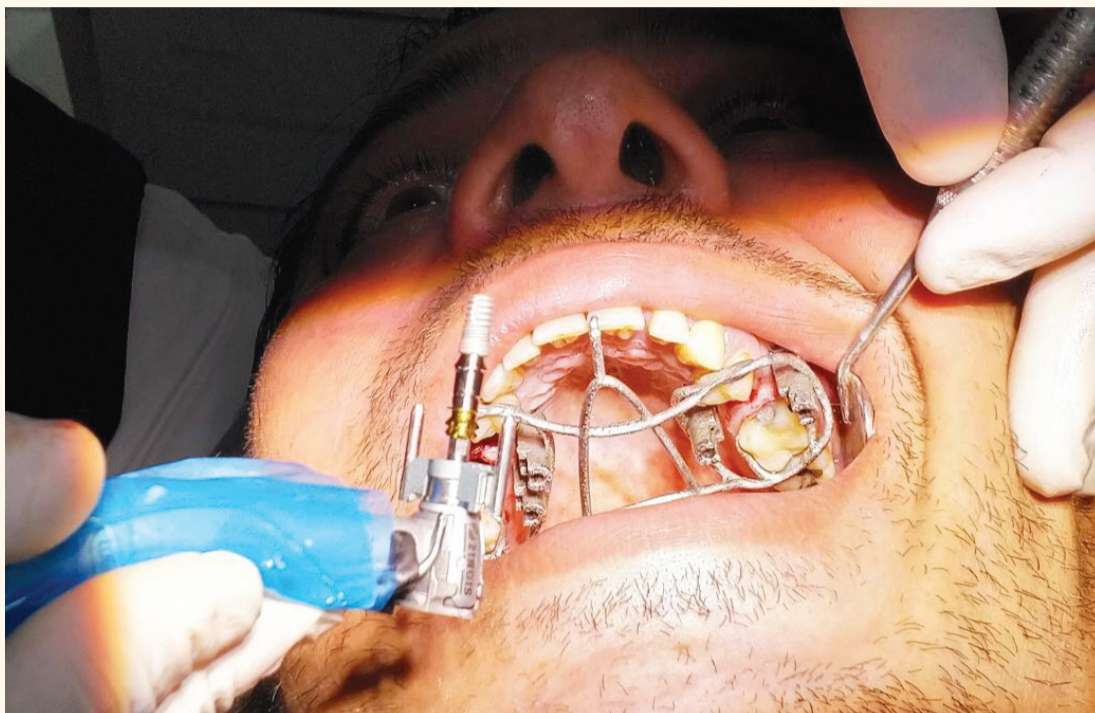
The open design of the guide gives great visibility and allows cooling

Our primary product line remains PFM crowns and bridges. However, since we last met, we have introduced two new products: Removable Partial Dentures and Metal Surgical Guides. The RPDs which we produce are a great solution for a partially edentulous patient who is not a candidate clinically or financially for implants. We use a metallurgical process called Solution Annealing which brings flexibility into our metal and helps with the fit for the patient. The second product is a metal 3D printed Surgical Guide. This is a really exciting innovation in Surgical Guides and we recently collaborated on a trial surgery to test the product in the Middle East region for the first time.