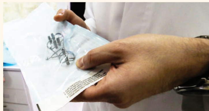
The metal 3D printed surgical guide which is sterilised before use