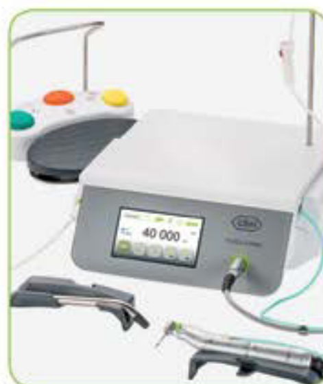
NEW Implantmed SI-1015 with wireless foot pedal option, Osstell ISQ option and LED powered motor option

Please visit us at the AAOMS in booth # 1310 to experience the latest in W&H surgical products! You can also go to www.wh.com/na for more information