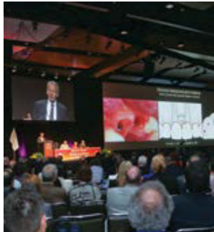
Attendees take part in an educational session at the 2017 AO Annual Meeting.