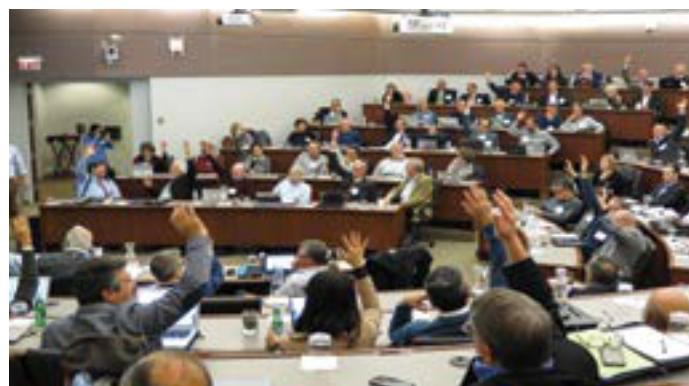
The World Workshop on the Classification of Periodontal and Peri-Implant Diseases and Conditions took place Nov. 9-11 in Chicago.

Participants conducted literature reviews, established case definitions and deliberated diagnostic considerations for the following topic areas: periodontal health and gingival diseases and conditions; periodontitis; developmental and acquired conditions and periodontal manifestations of systemic conditions; and peri-implant diseases and conditions. The inclusion of peri-implant diseases and conditions within periodontal