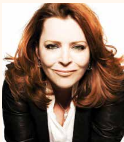
Comedian Kathleen Madigan will be featured at the Hinman Dental Meeting's keynote session in March.