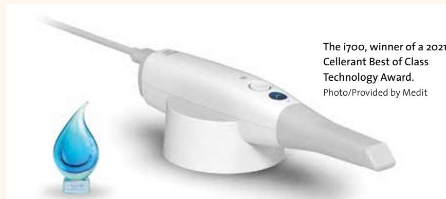
The i700, winner of a 2021 Cellerant Best of Class Technology Award.