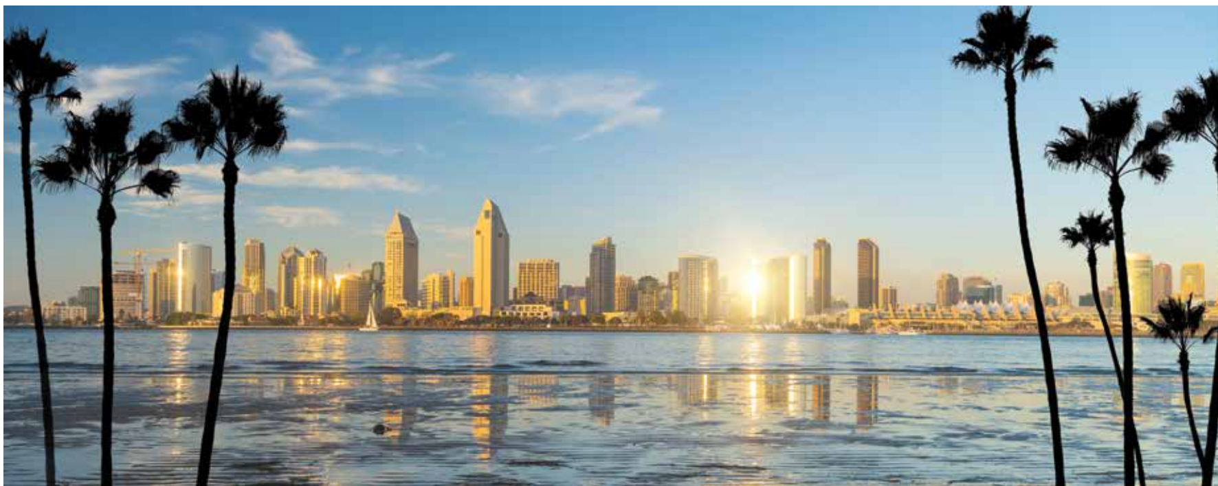
The 2022 AO Annual Meeting will return live and in-person from Feb. 24 to 26 and will take place at the San Diego Convention Center.