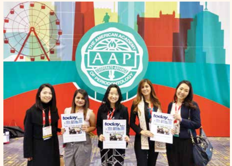
Attendees of the 2019 AAP Annual Meeting take a picture on the first day of the show. This year's meeting takes place from Thursday, Nov. 4 to Sunday, Nov. 7, in Miami Beach, Fla.

The AAP is closely monitoring the COVID-19 pandemic to ensure the utmost safety of all 2021 Annual Meeting at-