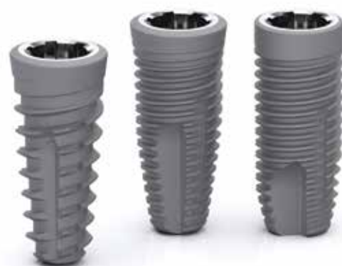
A look at the Neoss ProActive Edge implants.