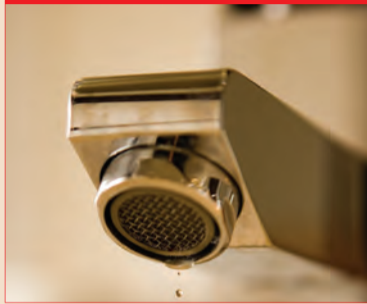
Save water! NSM takes on new challenge