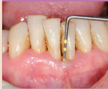
Practical periodontics Amit Patel discusses periodontal disease