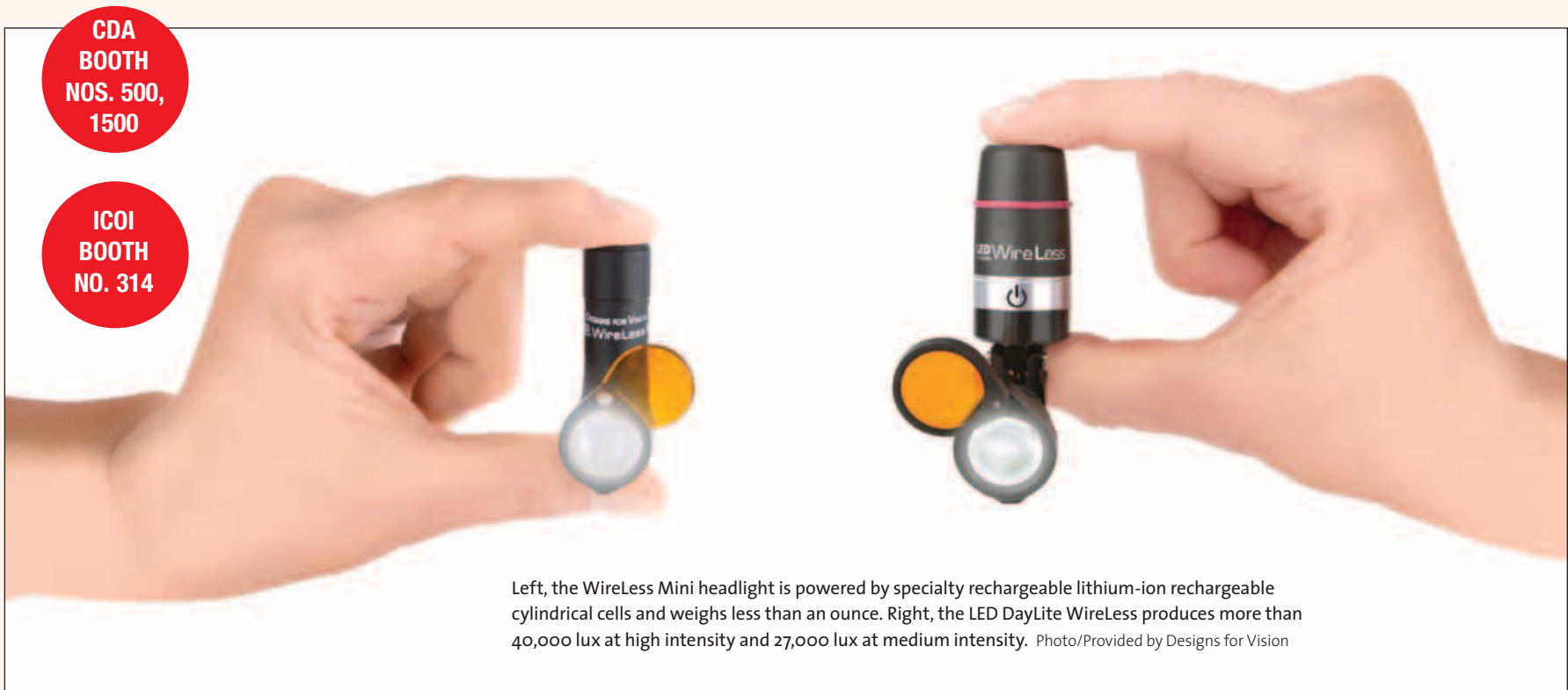
Left, the WireLess Mini headlight is powered by specialty rechargeable lithium-ion rechargeable cylindrical cells and weighs less than an ounce. Right, the LED DayLite WireLess produces more than 40,000 lux at high intensity and 27,000 lux at medium intensity.