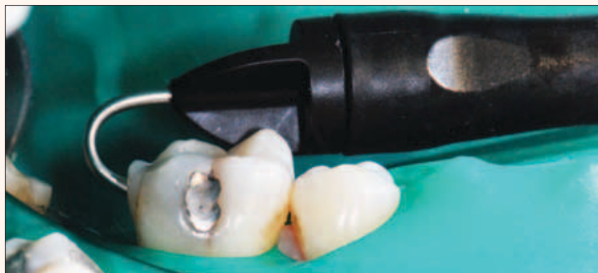
The metal cannula on the Luer Lock tip is 360-degree rotatable and can be bent up to 180 degrees without reducing the inner diameter and material flow.

The metal cannula is rounded by a vibratory finishing process. Because of this special surface treatment, the metal is