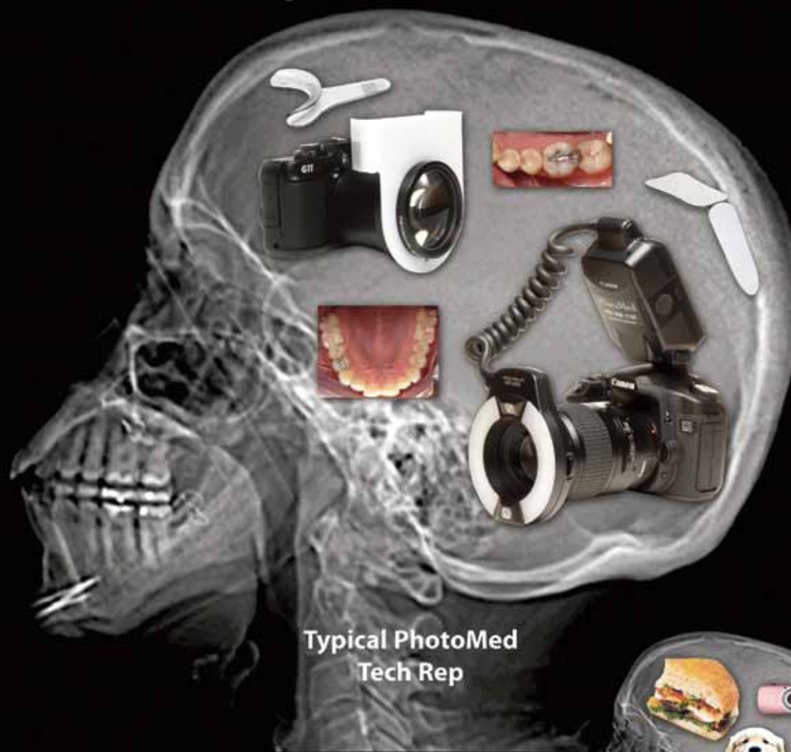
Typical PhotoMed Tech Rep

It's not an exaggeration! Our tech staff fully understands the challenges of dental photography and we have the answers you need. The guy at your local camera store may know about landscape or sports photography, but they will look at you like you're from Mars when you start talking about occlusal views and the distal surface of second molars.