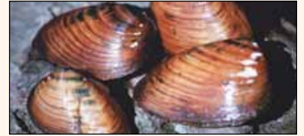
A substance similar to an adhesive made by mussels, such as these clubshells, that enables them to stick to surfaces, shows promise in treating sensitive teeth.

The authors acknowledge funding from a National Natural Science Foundation of