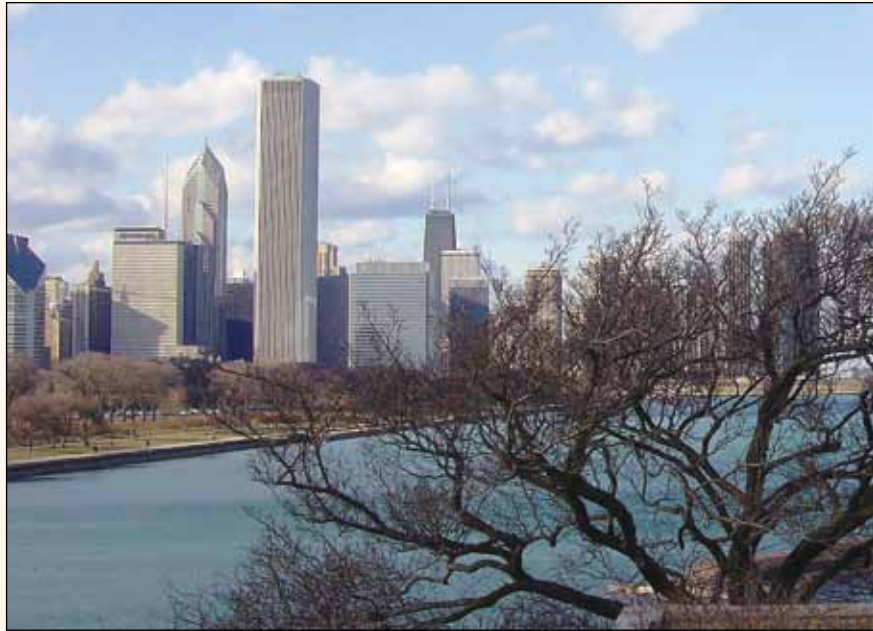
America's second city hosts the Chicago Dental Society Midwinter Meeting. The event includes an exhibit hall with more than 600 exhibitors.