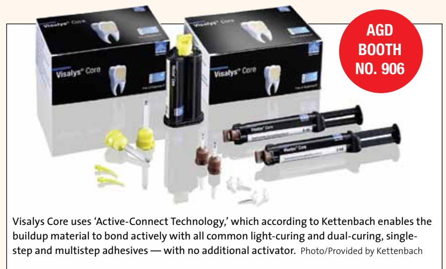
Visalys Core uses 'Active-Connect Technology,' which according to Kettenbach enables the buildup material to bond actively with all common light-curing and dual-curing, single-step and multistep adhesives — with no additional activator.

According to the company, the technology simply provides a firm foundation — stable and precise. The company reports that Visalys Core ensures easy and reliable handling with “excellent positional stability.” At the same time, it exhibits good flowability and low extrusion force. The compressive strength results in a sta-