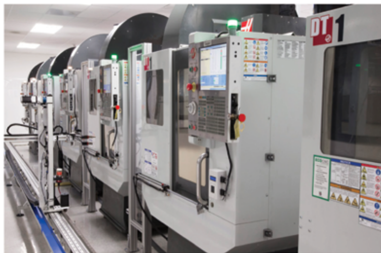
Our engineering team has developed robotically attended manufacturing systems for custom implant abutments, resulting in maximized consistency and controlled costs.