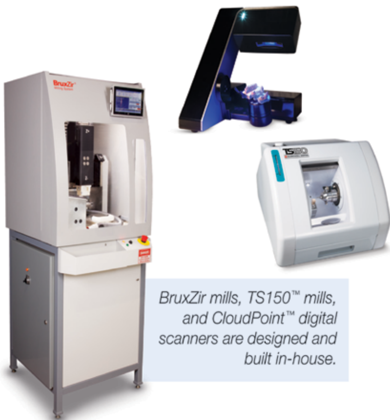
BruxZir mills, TS150™ mills, and CloudPoint™ digital scanners are designed and built in-house.