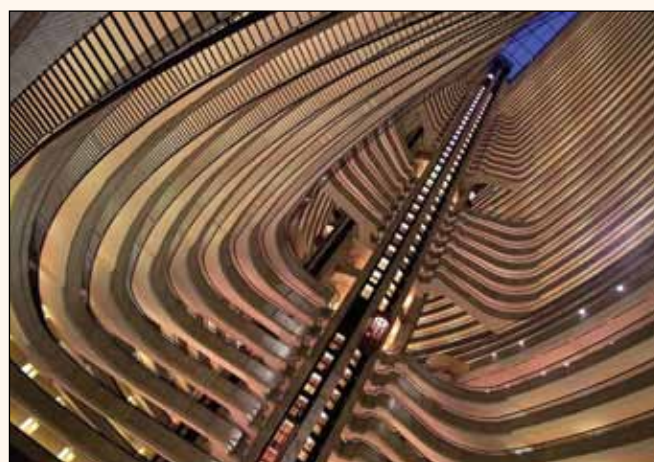
At the Atlanta Marriott Marquis, host site of this year's National Dental Association annual meeting, you can ride on high-speed elevators that provide sweeping views of the hotel's towering 47-story atrium.

NDA-HEALTH NOW is a grassroots, community-based effort to increase access to oral health in underserved populations. The event will be hosted for the YMCA's Summer Camp children, their families and the surrounding commu-