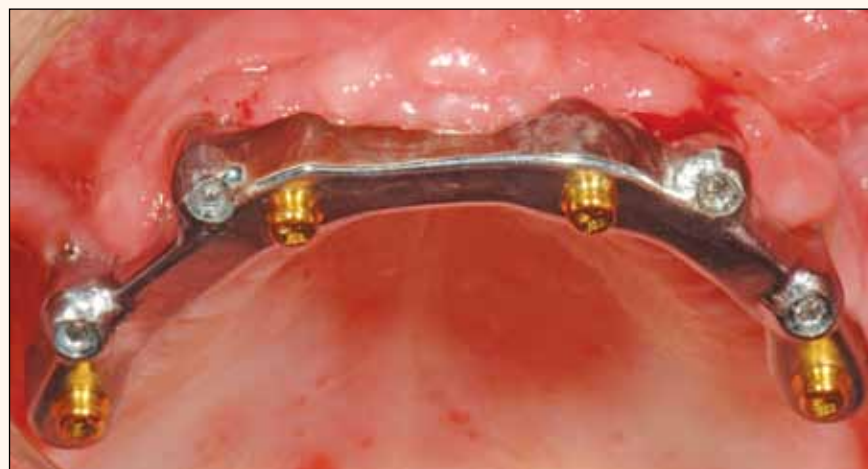
Fig. 1: The bar screwed on the implants on the upper jaw with the four OT Equator attachments.

tulous, however, it is our duty to try to improve the quality of his life by restoring proper chewing function (without further jeopardizing health) and to im-