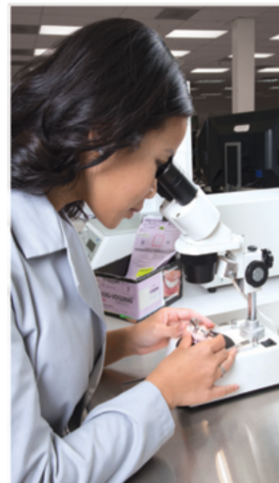
Your prescriptions are filled using best-in-class products such as BruxZir Solid Zirconia, IPS e.max®, Obsidian, Comfort H/S™ Bite Splints and Silent Nite® sl.