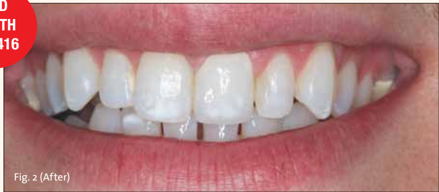
Fig. 1: A 27-year-old male patient presents with an old PFM crown on tooth #9, which had undergone endodontic treatment about 10 years prior to address decay. A darkened margin, visible due to gum recession on the facial, posed a distinct problem for this anterior case. In addition, the esthetics of the PFM crown were noticeably inadequate. Fig. 2: Obsidian Pressed to Metal crown masks the darkened stump shade at the gingival third while also blending in with the overall smile.