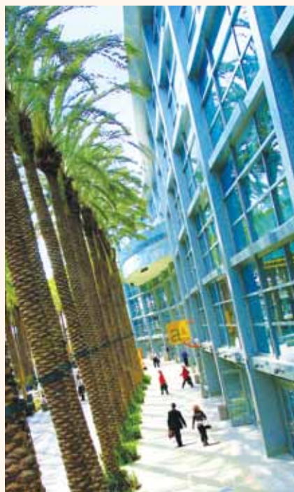
The Palm Court Plaza in front of the Anaheim Convention Center, location of CDA Presents: The Art and Science of Dentistry.

(Source: Greater New York Dental Meeting)