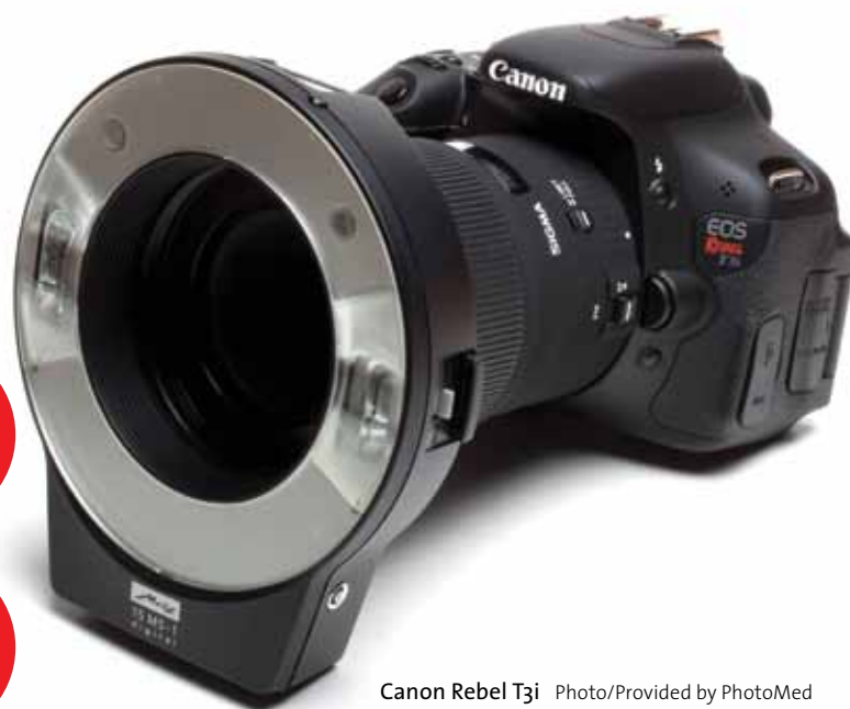
Canon Rebel T3i