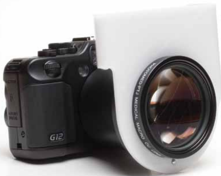
Canon G12 Photo/Provided by PhotoMed