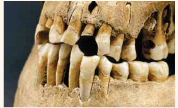
Among the thousands of artifacts in the collections of the National Museum of Natural History is this skull, dated at 1660–1680, from the Patuxent Point site, Calvert County, Md., showing how clenching a clay pipe wore a hole into the teeth.

American Academy of Cosmetic Dentistry invites you to explore National Museum of Natural History at May 2 welcome reception