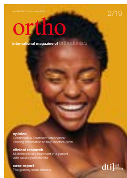
Cover image