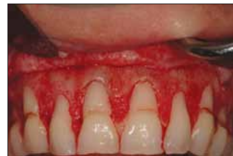
Fig. 6a: Final bone contours after osteotomy.