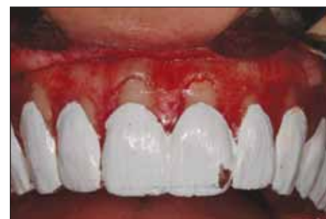
Fig. 6b: The final osseous contour lies at least 3 mm from the anticipated restorative margins, as outlined by the surgical guide.