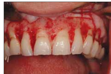
Fig. 5: Initial full-thickness flap reflection at first stage surgery. Note the apical level of the alveolar crest compared to the cemento-enamel junction.