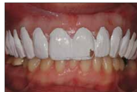
Fig. 4: Surgical guide in place in the mouth. The ideal tooth contours are shaded in white.