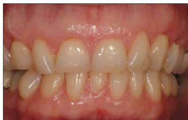
Fig. 2: Excessive keratinized gingiva, a thick soft-tissue biotype and asymmetric gingival contours exist.