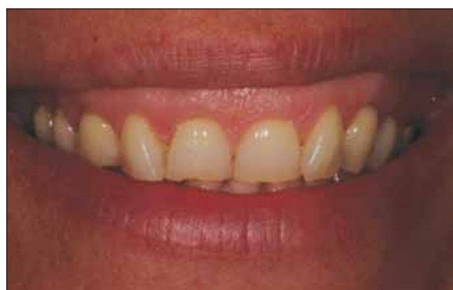
Fig. 1b: Initial view of maxillary anterior teeth upon smiling. The clinical crowns appear short and demonstrate attrition.