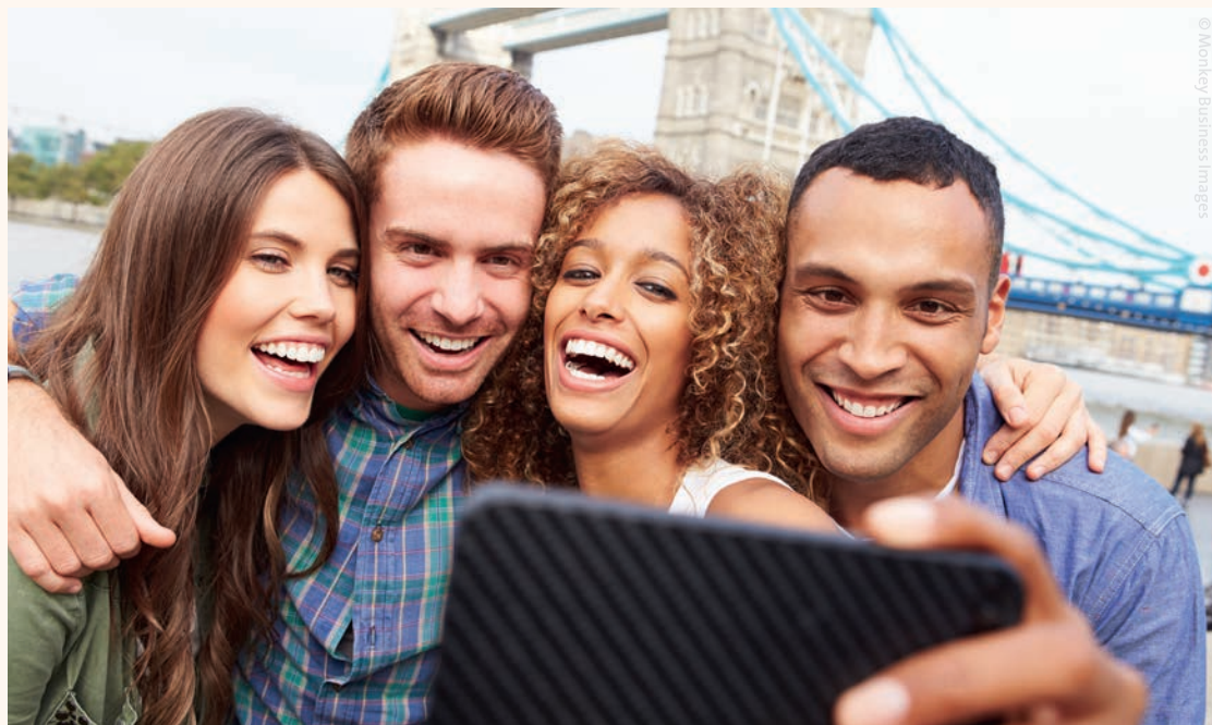
Londoners have the best smiles in all of Britain, according to a new survey.

While the capital and the two northern cities came out top, smiles in Salford, Wolverhampton and Lichfield were rated the lowest. Overall, the North of England scored significantly higher in the survey with cities like Manchester, Leeds and Newcastle all ending up in the top 10. However, southern cities like Bath, Bristol and Cambridge also came out high on the list.