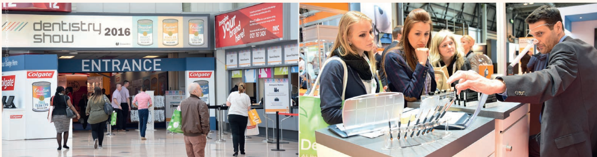
Left: Thousands of professionals attended the show in 2016 again. Right: Product presentations.