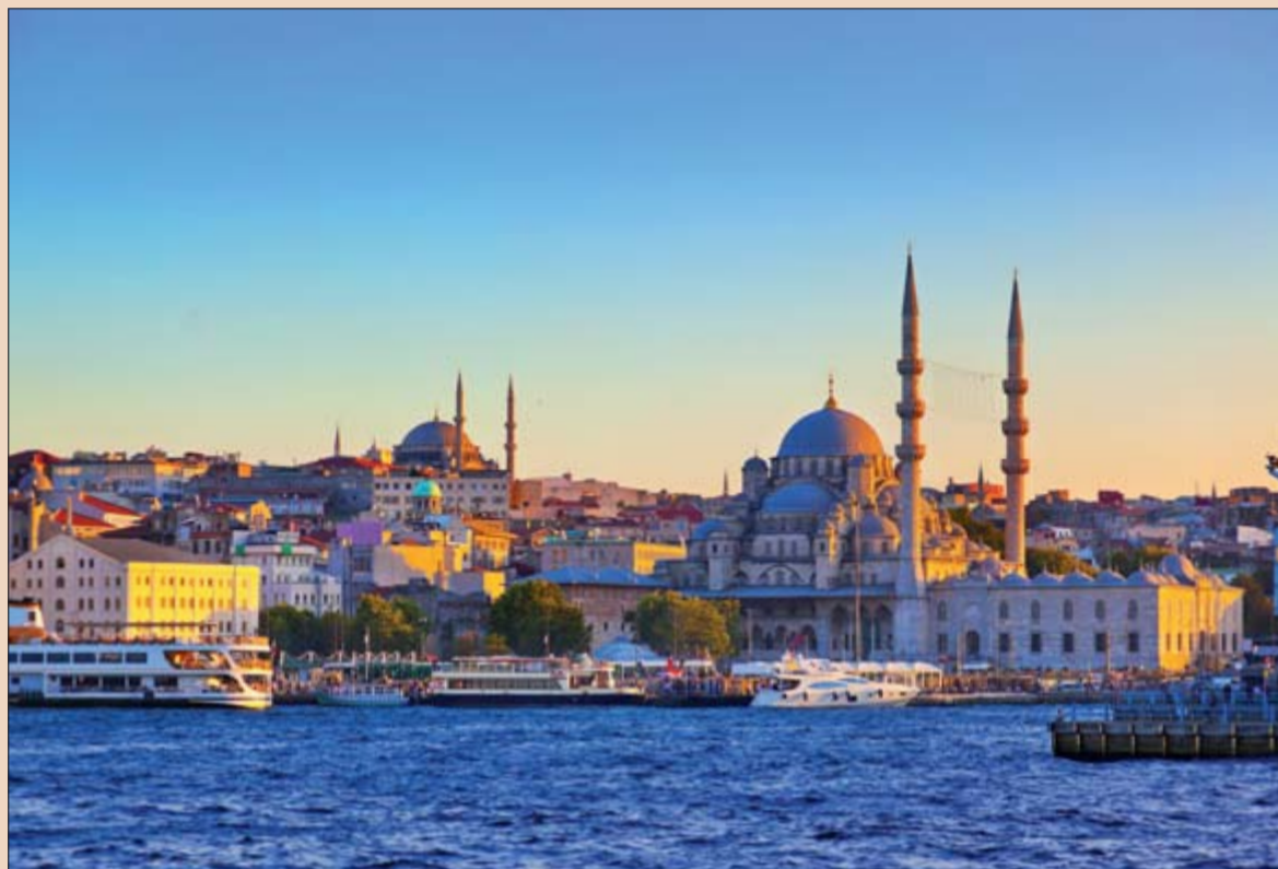
View of Istanbul at sunset. Turkey is expected to become one of the major growth markets for dental implants in Europe.

Research has shown that a lack of intimate fit of the im-