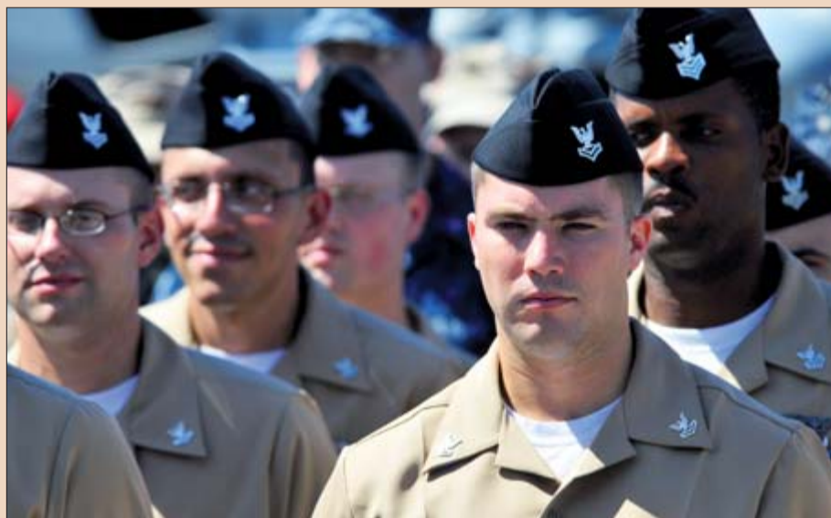
US Sailors stand in ranks at a promotion ceremony during Pacific Partnership 2011 onboard the amphibious transport dock ship USS Cleveland in the Arafura Sea.

WASHINGTON, DC, & SAN DIEGO, CA, USA: In one of the worst natural disasters in recent times, the Boxing Day tsunami killed more than 200,000 people in South-East Asia. Following the catastrophe, humanitarian missions organised by the Pacific Partnership have been conducted in the region each year since 2006. Recently, the first support troops including military dental providers were deployed from around the world for this year's campaign.