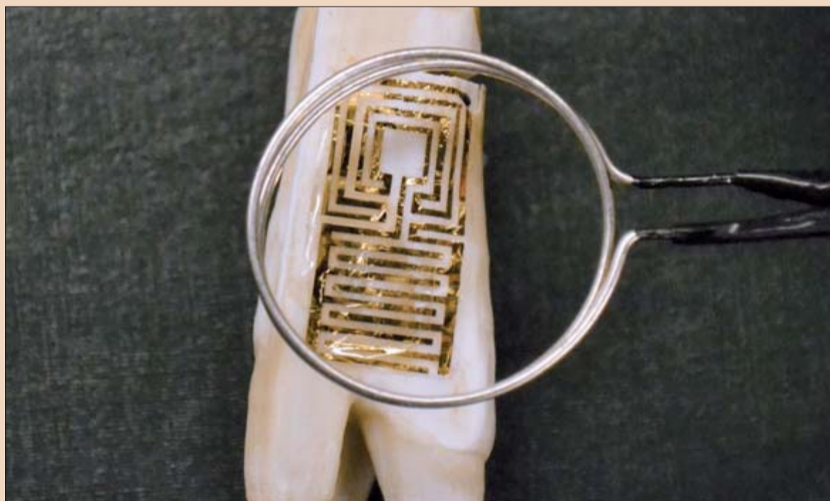
The sensor consists of a graphene layer printed onto a bioresorbable silk substrate.

The signals are received from a gold antenna on a tattoo that is attached to an array of graphene—very small particles of carbon—that triggers a signal when in contact with bacteria