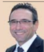
Professor Lior Shapira Israel

Prevention of disease, in this case chronic periodontitis, is always better than cure. Developing a vaccine for periodontitis has been a hot subject for periodontal researchers. The old dogma was that the role of vaccination is to induce a humoral immune response, meaning protection by the production of memory B cells and antibodies against the