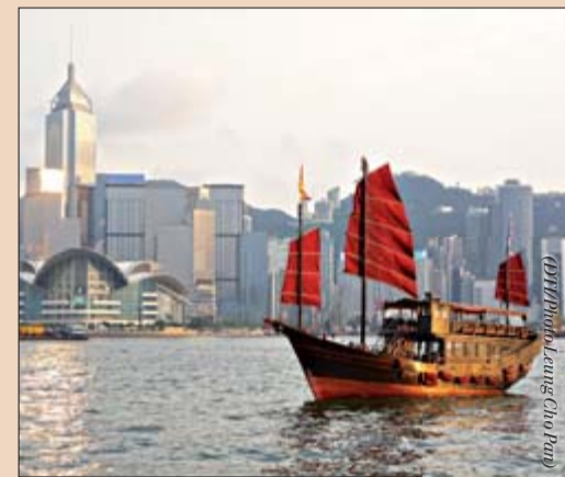
View of Hong Kong harbour.

In addition, the company distributes the pico mobile diode laser and duros, an Er:YAG dental laser device claimed to facilitate efficient hard-tissue surgical preparation and bone ablation tasks. DT