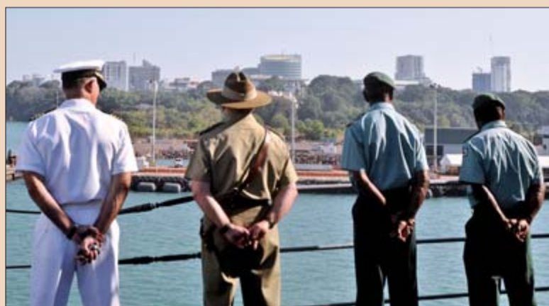
US Marines prepare for the deployment of military forces during the Pacific-Partnership mission in 2011. The annual campaign provides medical and dental relief to more than 20,000 people in South-East Asia. ▶ ASIA NEWS, page 2

According to the researchers, L-PRF is simple, inexpensive and easy to prepare in only 15 minutes. Moreover, it is free of additives, such as anticoagulant, a substance that prevents the clotting of blood, or chemicals for activation, they said. DTI