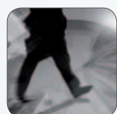
R4 Version III Practice Management Software

So not only do you get the very best service at all times, you also get peace of mind from knowing that your satisfaction is our top priority.