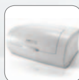
Kodak CR7400 Phosphor Plate Digital X-Ray