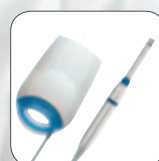
Kodak STV Digital Intraoral Camera