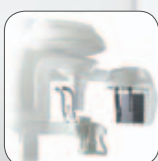
Kodak 9000 3D Extraoral Imaging