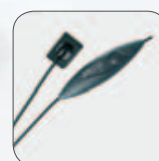
Kodak RVG6100 and 5100 Digital X-Ray