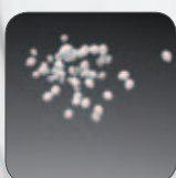
Managed Service Web Based Practice Management