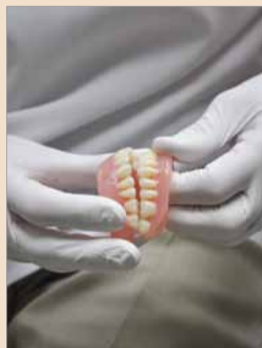
Killer bugs could live on dentures

The study has been published in the Journal of the American Dental Association . DT