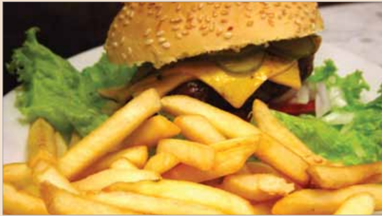
Experts call for a 'fat tax'