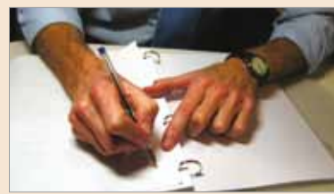
The GDC has published a discussion document regarding CPD

The GDC's current CPD requirements can be found on the website www.gdc-uk.org DT