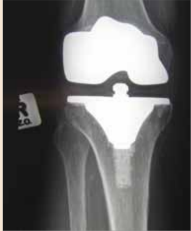
An example of a failed knee replacement

The culprit behind a failed hip or knee replacement might be found in the mouth. DNA testing of bacteria from the fluid that lubricates hip and knee joints had bacteria with the same DNA as the plaque from patients with gum disease and