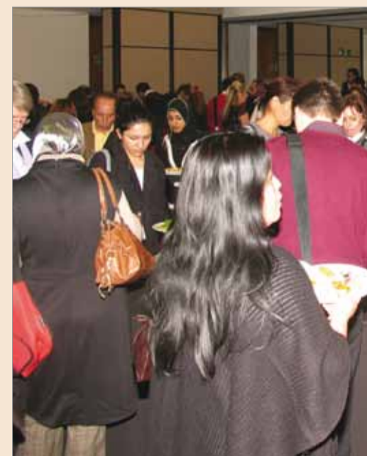
Delegates at the Clinical Innovations Conference 2011