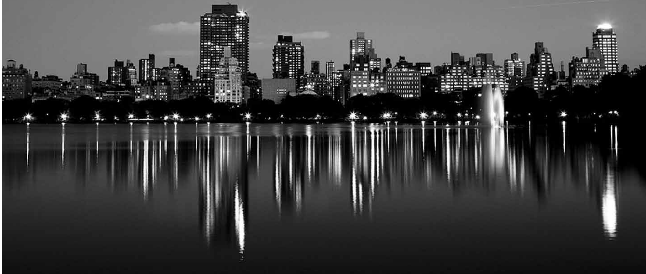
• The New York City skyline.