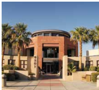
• The Las Vegas Institute for Advanced Dental Studies in Las Vegas.

The Core I program at LVI is the first step on that journey. That's why when you call, we answer the phone: "LVI, where lives are changing daily!"