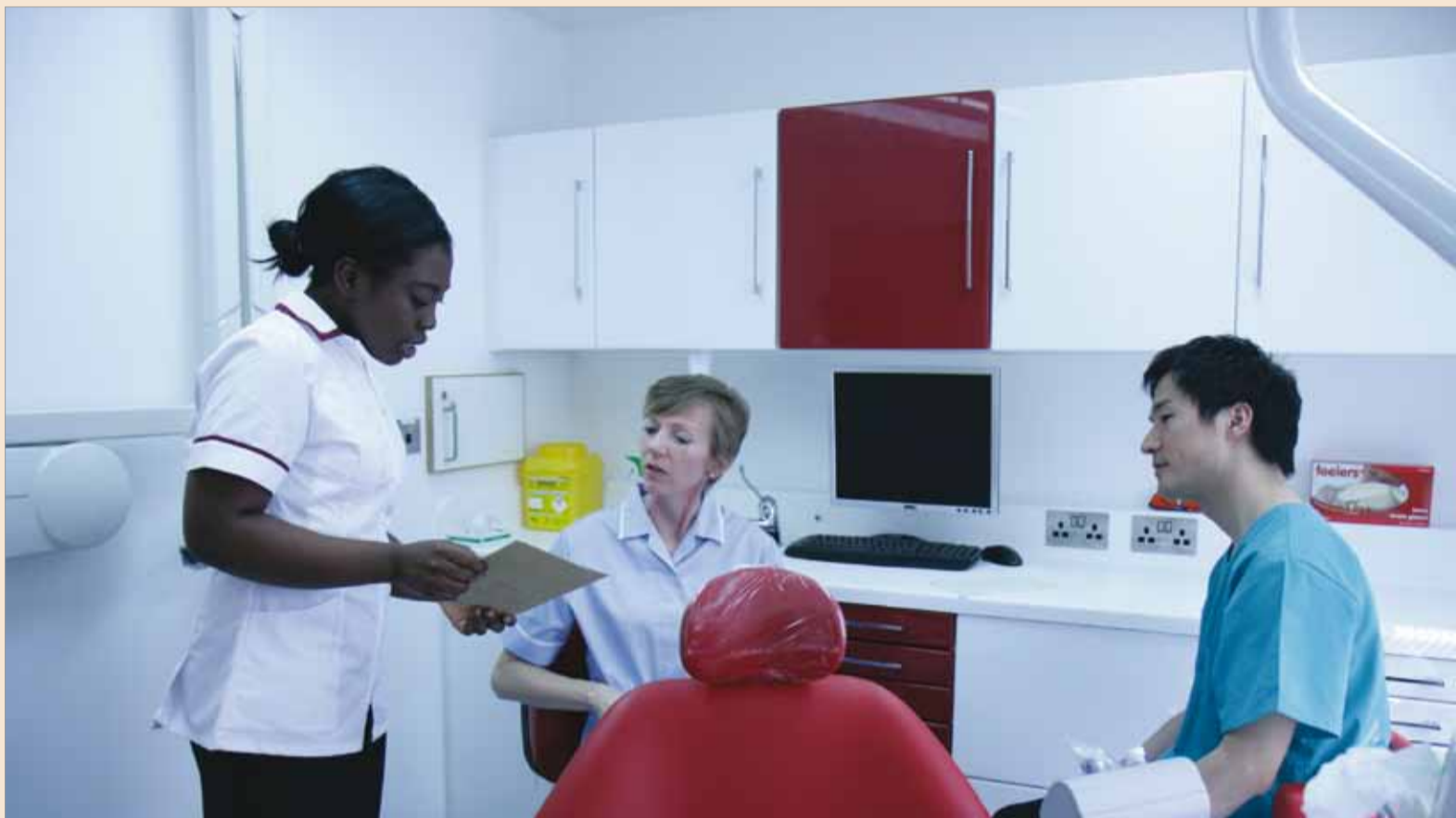
Are nurses getting the best deal when it comes to cost?