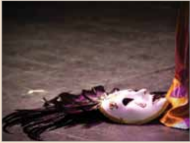
The MyFaceMyBody Awards has been organised to celebrate and award those who have made a difference in the cosmetic sphere

The aesthetic and dental business is one of the most forward-looking industries in the world. It is constantly pushing the boundaries of what is possible to achieve and matches technological advances with human endeavour to create stunning solutions which change people's lives for the better.