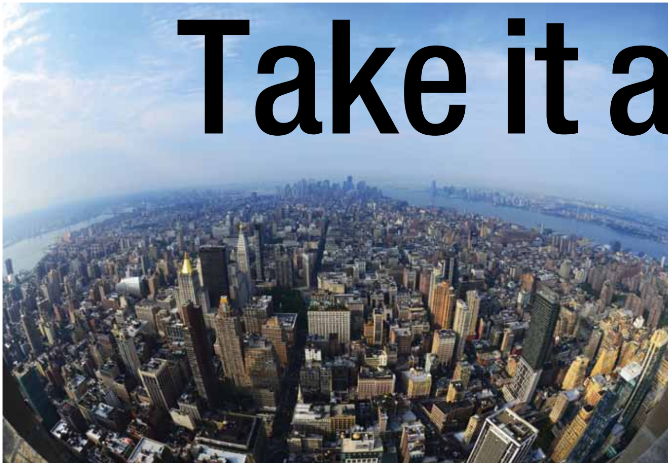
Exhibit hall opens its doors for the 88th annual Greater New York Dental Meeting