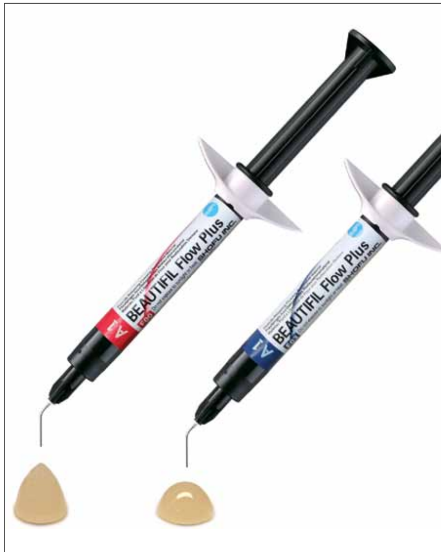
• Beautiful Flow Plus

How long have you been using Beautiful Flow Plus and Beautiful II,