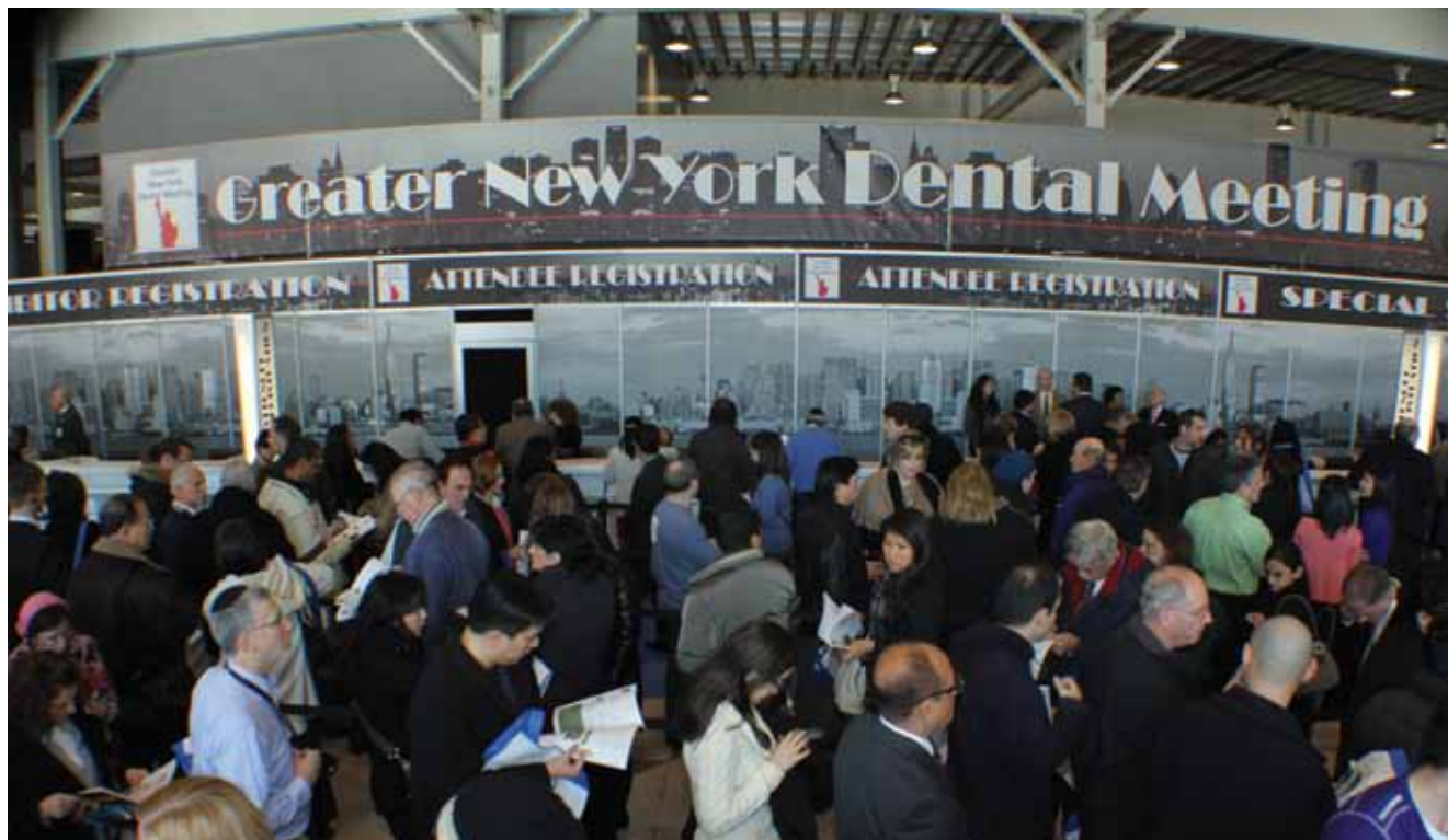
Attendees register for the Greater New York Dental Meeting.

Once again, the GNYDM offers an unparalleled educational program,