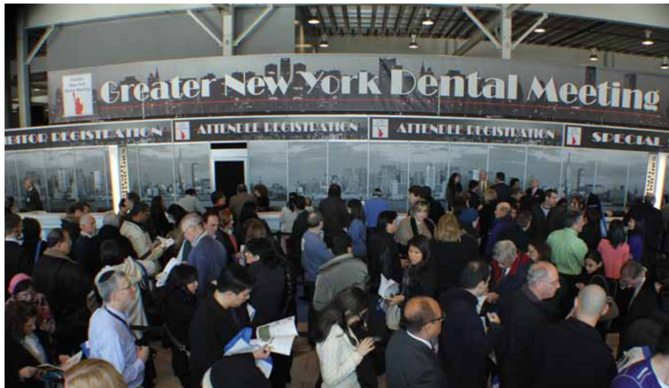
Attendees register for the Greater New York Dental Meeting.

Once again, the GNYDM offers an unparalleled educational program,