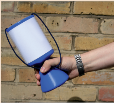
Some charities suffer due to their profile

A new survey looking into public support for cancer charities has uncovered a worrying disparity in the proportion of donations throughout the sector.