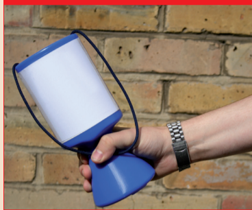
Cancer divide Charities face hard times