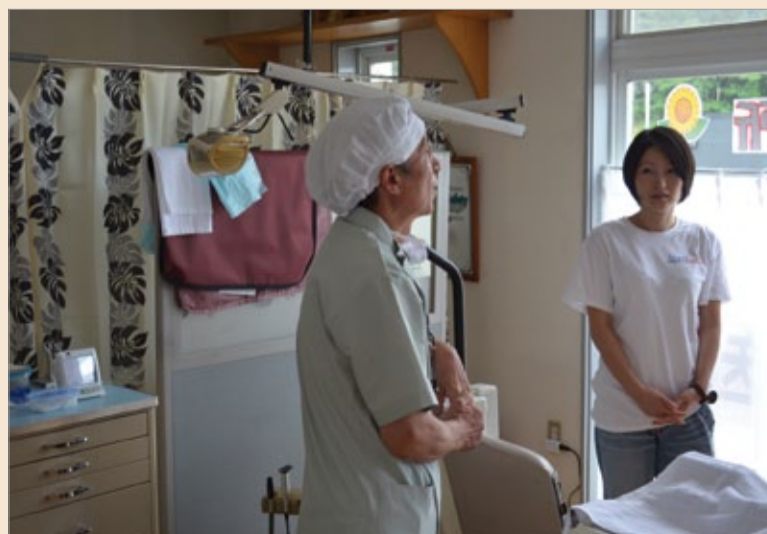
The dental centre can treat 20 patients a day

How was the health infrastructure affected by the disaster in the area you are