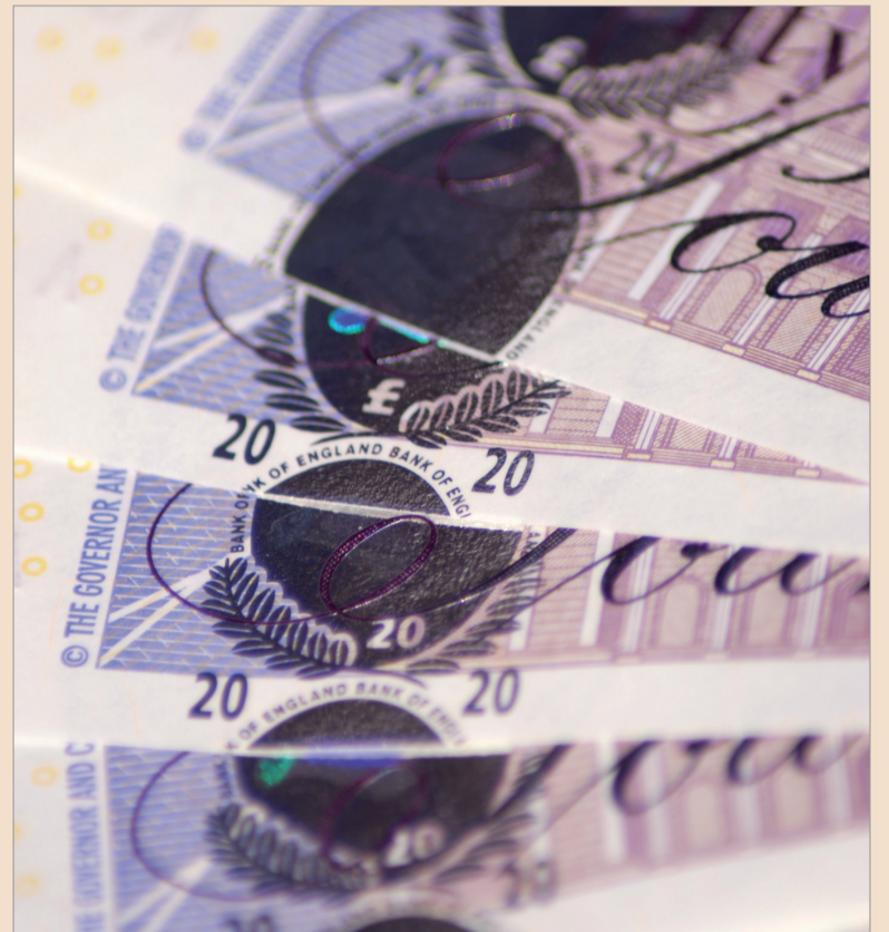
Are you looking for a strategy to grow, but haven't found the right route?

Interested practices can contact Amarjit by contacting him directly by email -gill@smilesahead.biz - to set up an exploratory meeting. DT