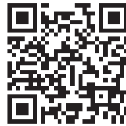
Digital engagement Rita Zamora discusses QR codes