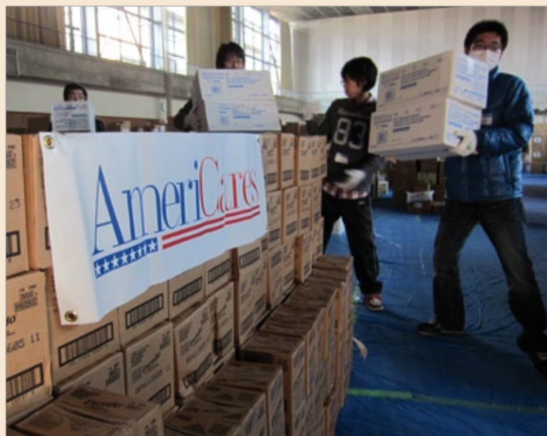
AmeriCares gives supplies to Japan