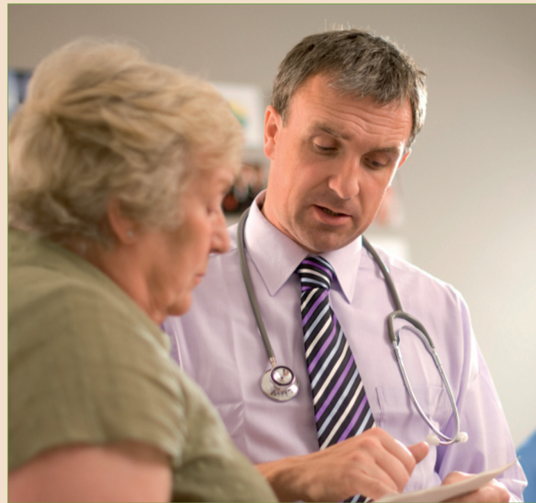
More referred patients are being seen by cancer specialists within 14 days of referral

“Our message to everyone is ‘If in doubt, get checked out.’” DT