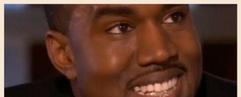
Georgia Jagger and Kanye West are not going for the perfect smile