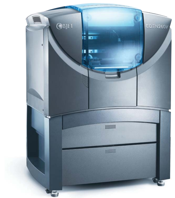
Objet Eden260V 3D Printer