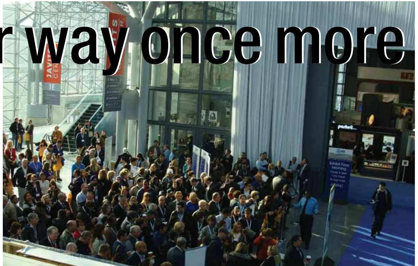
• It's almost as exciting as Black Friday! Attendees at the 89th annual Greater New York Dental Meeting assemble a few moments before the official exhibit hall opening.

On Sunday, opening day of the meeting, the exhibit hall floor was jam packed with meeting attendees looking for new, exciting offerings. On display here at the Jacob K. Javits Center are products and services from hundreds of exhibiting companies.