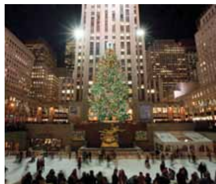
• Ice skaters go in graceful circles beneath the gilded statue of Prometheus and the glittering Christmas tree at Rockefeller Center.

It doesn't matter whether this is your first time in New York or if you come here every year. There is always something new to discover. Turn the pages for some ideas.