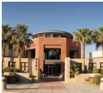
• The Las Vegas Institute for Advanced Dental Studies in Las Vegas.

The Core I program at LVI is the first step on that journey. That’s why when you call, we answer the phone: “LVI, where lives are changing daily!”