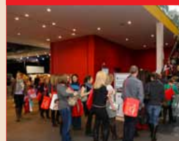
BSDHT 2012 A review of the Oral Health Conference