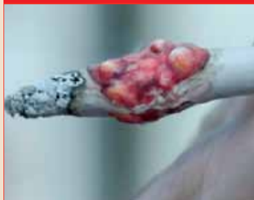
Shock ads New campaign targets smokers