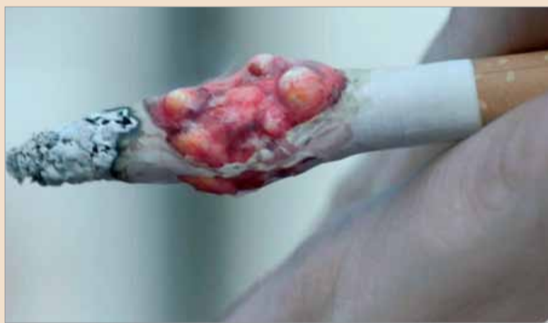
One of the new anti-smoking adverts

The Department of Health has launched a new campaign to encourage smokers to quit this new year.