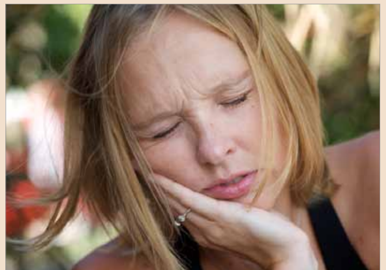
Sensitivity can impact on daily life

"Polydopamine coating remarkably promoted demineralised dentin remineralisation, and all dentin tubules were occluded by densely packed hydroxyapatite crystals," they concluded. "Thus, coating polydopamine on dental tissue surface may be a simple universal technique to induce enamel and dentin remineralisation simultaneously." DT