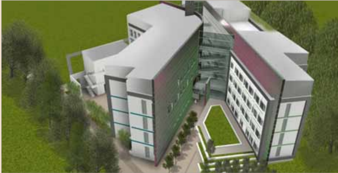
An artists impression of the new facility

Plans to build a new £50 million dental hospital in Birmingham have been approved by planning officers at Birmingham City Council.