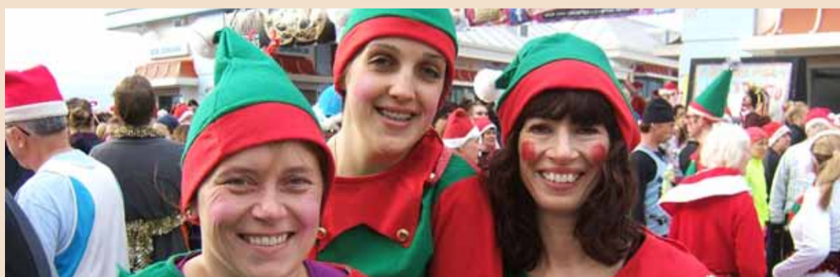
Braving the elf-ements: staff from College Street Dental

Hundreds of pounds have been raised for charity by dental staff following a Christmas fun run.