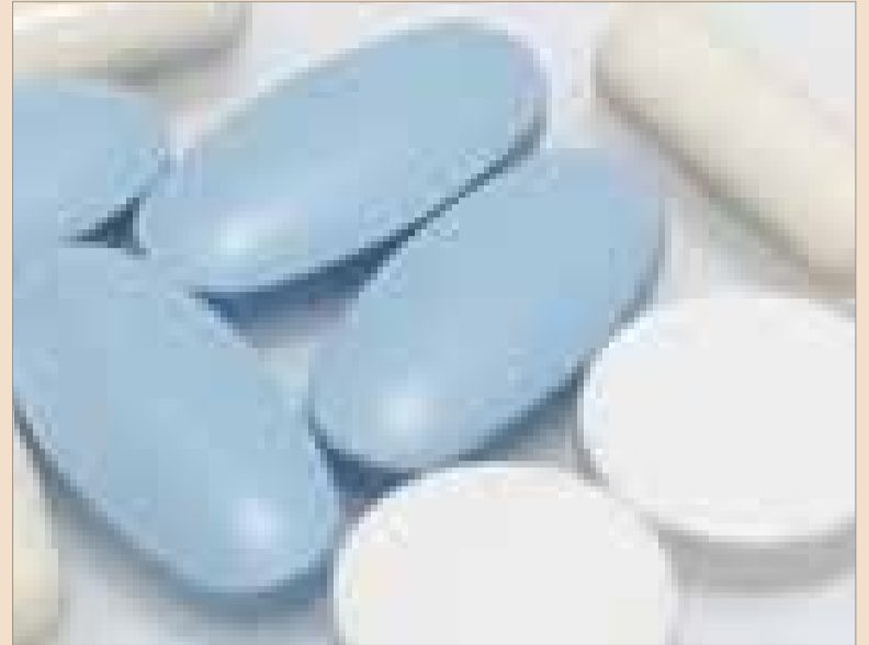
Routine antibiotics should not always be recommended to patients says the AAOS

The guideline was based on clinical research which examined patients with a prosthetic hip or knee, half of which had an infected prosthetic joint. Invasive dental procedures, with or without antibiotics, were not found to increase the odds of developing a prosthetic joint infection. DT