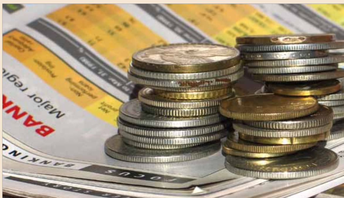
£1.7m in funding has been invested in the research project, aimed at investigating the cost-effectiveness of prevention programmes

Prof Porter said: "The sampling method is non-invasive and merely requires brushing the surface of the lesion; if the accuracy of dielectrophoresis is proven to deliver an accurate diagnosis, then the screening of large at risk populations will become both practical and cost effective, potentially saving many lives." DT