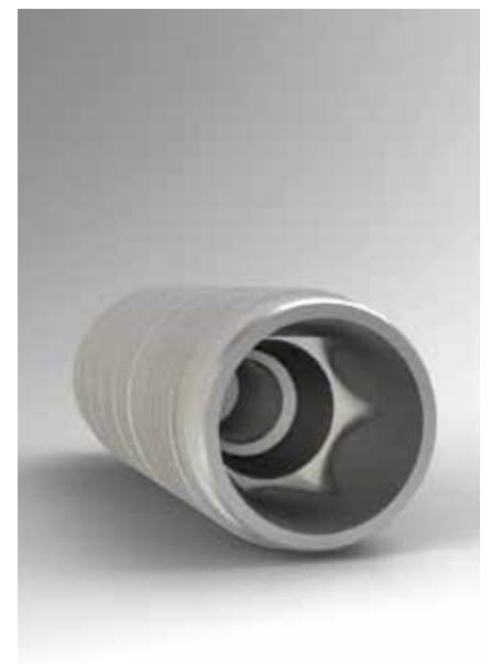
• Fig. 9: The Champions (R)Evolution inner conus with the integrated 'Hexadapter' allows the micro-gap to be smaller than <math>< 0.6 \mu\text{m}</math> and the abutment to be rotation proof.

However, we do not just insert the implant itself, but also the integrated "Gingiva-Shuttle," which is tightly screwed to the implant at a torque of 5-10 Ncm. In this way, there is