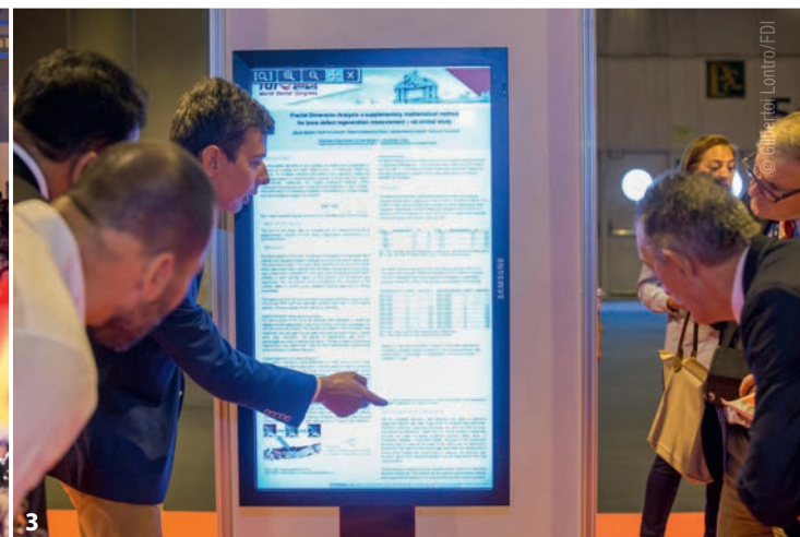
Fig 1: FDI is one of the oldest dental organisations and its membership comprises about 200 national dental associations and specialist groups in over 130 countries. Fig 2: The internationality of the event is drawn home when FDI member countries display their countries' flags during the rousing flag ceremony, which is part of each congress opening. Fig 3: Presentations and posters submitted and reviewed by an expert panel ahead of the congress will be on display in Sydney.

O rganised annually by FDI, the World Dental Congress is one of the most prestigious continuing education events in the global dental event calendar. The congress aims to advance the art and science of dentistry, providing a platform for both the dental profession and the dental industry.