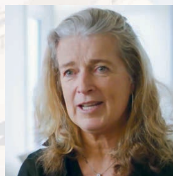
Prof. Tara Renton, UK

Title: Laser applications in soft tissues for the general practitioner Date: 26 September Time: 9:00–9:45 Room: The Gallery